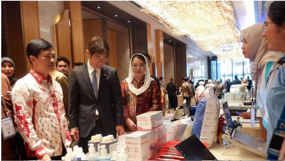
ASEAN-Japan Medical Devices Regulatory Symposium (14 May 2025, at a hotel)