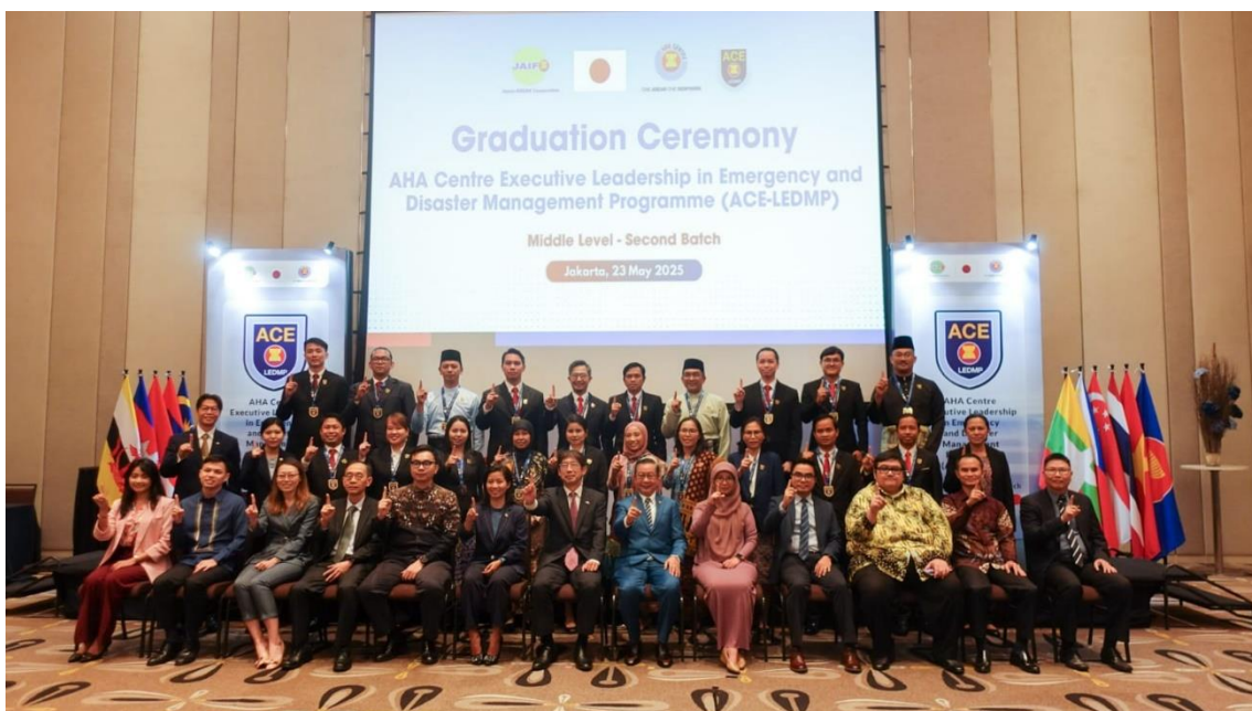
AHA Centre Programme (ACE-LEDMP) Graduation Ceremony (23 May 2025, at a hotel in Jakarta)

This time, we will focus on the potential for decarbonization in the ocean. We will develop available Blue Carbon Profiles (seagrass and peatland) for each of the 11 countries including ASEAN member states and Timor-Leste, and Blue Finance Profiles (blue bonds, blended finance, public-private partnerships, etc.) that are necessary for commercialization. Additionally, we will work with more than 50 academic research institutions and over 20 experts in this field—including Gadjah Mada University in Indonesia and ERIA—to build a network for implementation and scale-up. The project is scheduled to conclude in March next year. The following day, I was interviewed on this topic on television . We plan to continue working towards implementation hereafter.