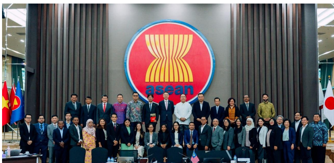
The 4 th AICHR-Japan Interface Meeting

On the same day, Special Envoy Kishida visited the Asia Zero Emission Center within the Economic Research Institute for ASEAN and East Asia (ERIA) and was given an explanation of the AZE Centre's vision for decarbonization and the roadmap for achieving this goal.