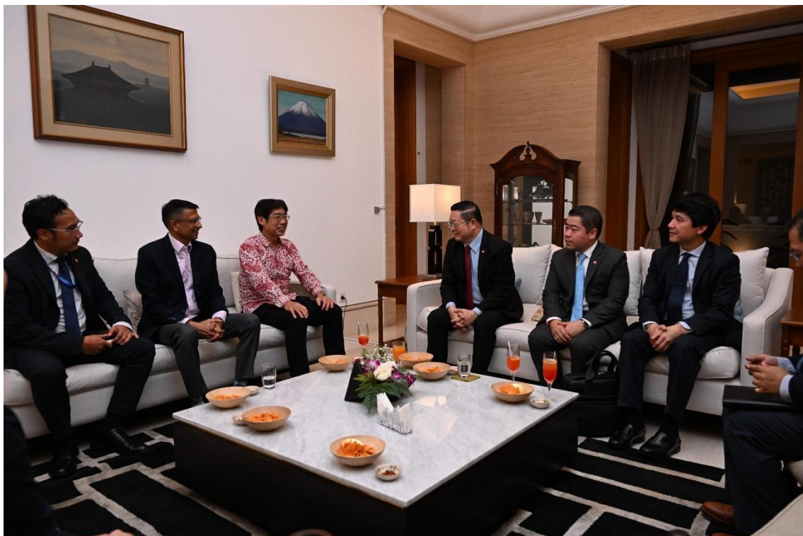
Dinner Meeting with the ASEAN Secretary-General Dr. Kao Kim Hourn

Through this training course, we hope that each participant will enhance their knowledge and experience, take on leadership roles within their respective countries' disaster management agencies in the future, and promote the ASEAN initiative, "One ASEAN One Response."