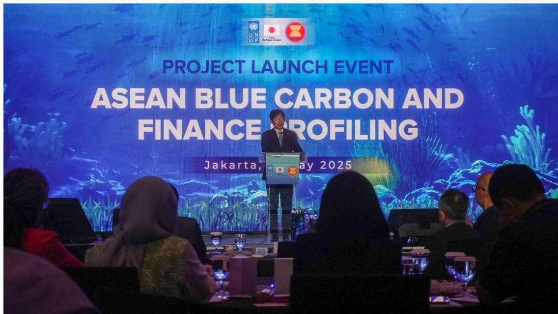
ASEAN Blue Carbon and Finance Profiling Launch Event (21 May 2025, at a hotel in Jakarta)

In my opening remarks , I explained the importance of this symposium, Japan's ongoing support through JAIF, and the efforts of PMDA which plays a central role. After the opening ceremony, Vice Minister and I visited various booths set up by Indonesian companies, and participated in a press conference for this symposium, where I sensed the enthusiasm of both the participating companies and the media.