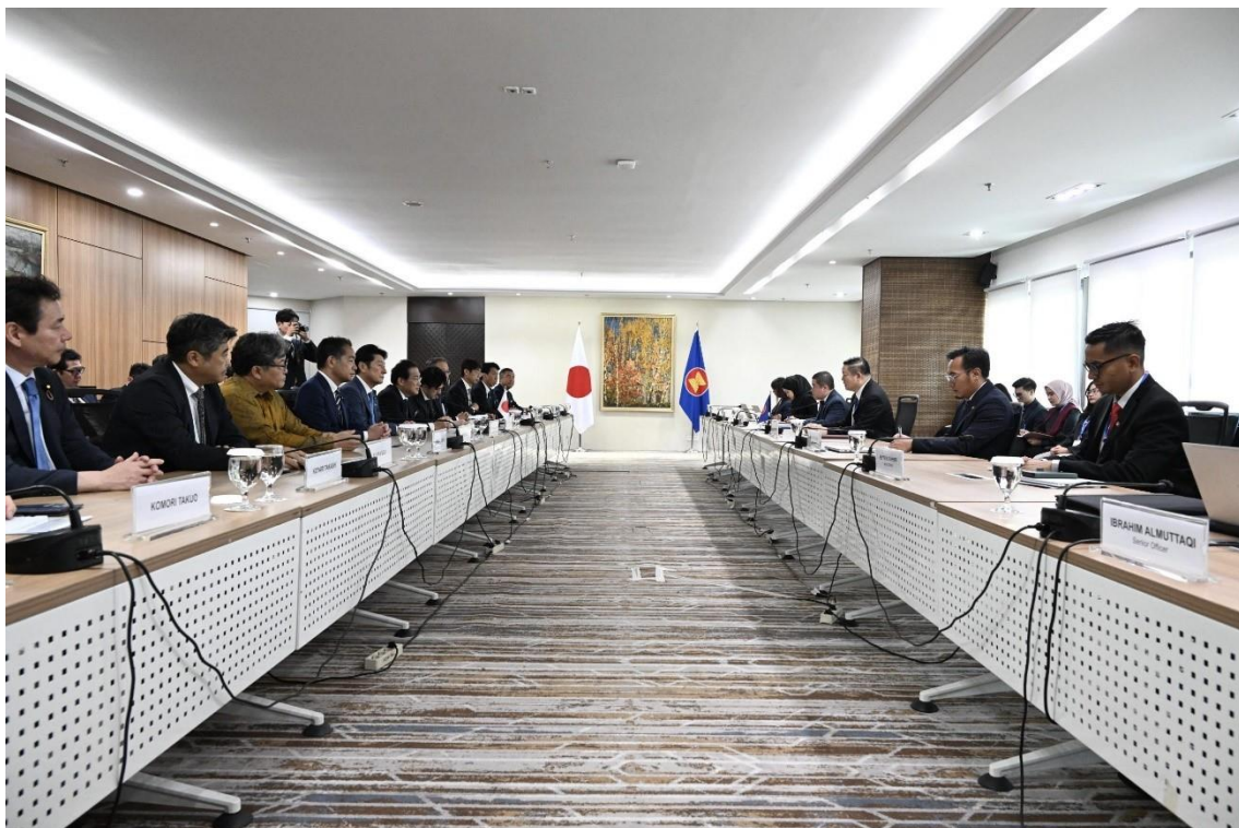
Meeting between ASEAN Secretary-General Dr. Kao Kim Hourn and Parliamentary Association of AZEC (5 May 2025, at the ASEAN Headquarters/Secretariat,)

Through this series of events, I felt that hereafter it is important to promote collaboration with a wide range of partners, building on the deepening of ASEAN-Japan cooperation. In this edition of the newsletter, I would like to share recent events and reflect together with you on how we can further strengthen collaboration with our partners.