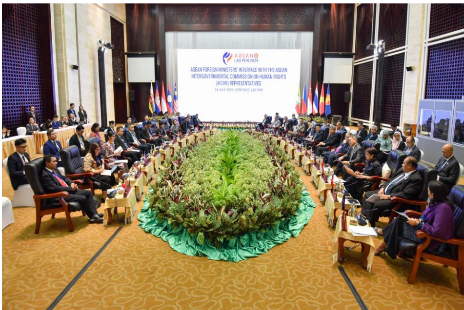
AICHR – ASEAN Foreign Ministers interface 2024