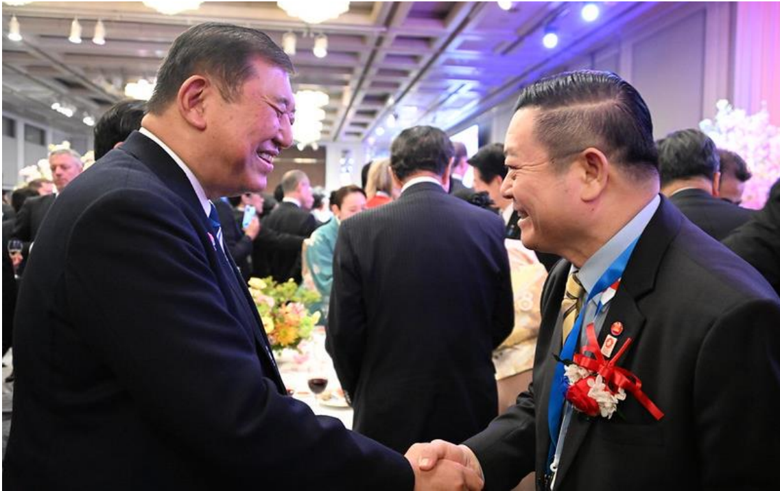
Prime Minister Ishiba greeted ASEAN Secretary-General Dr. Kao Kim Hourn at the Welcome Reception for the Expo 2025 Osaka, Kansai, Japan (12 April 2025, at a hotel in Osaka,)

Here in Jakarta, work started to pick up on 28 March during the Lebaran holiday (a festival that marks the end of Ramadhan), as a large earthquake had occurred in central Myanmar. Our mission was in contact with the ASEAN Coordinating Centre for Humanitarian Assistance on Disaster Management (AHA Centre) and Tokyo to coordinate assistance.