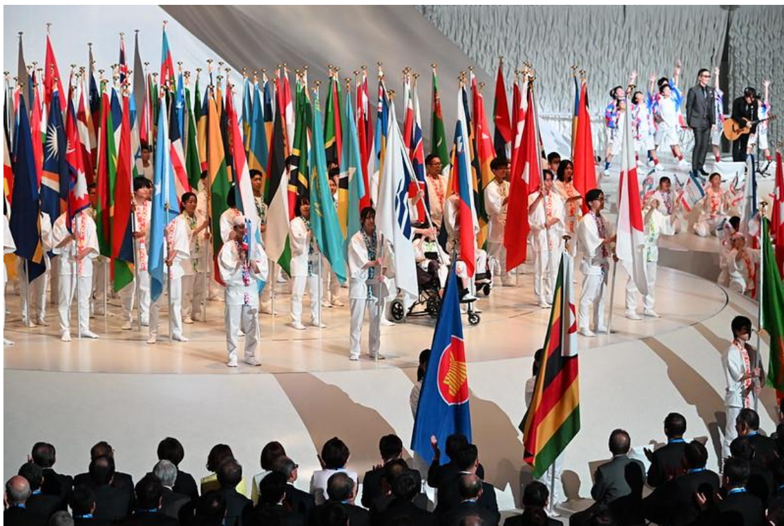
Opening Ceremony for the Expo 2025, Osaka, Kansai, Japan (12 April 2025, at the Expo 2025 Venue,)