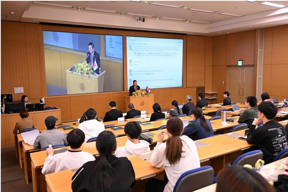
ASEAN Secretary-General Dr. Kao Kim Hourn's special lecture at Kansai University (14 April 2025, at Kansai University,)