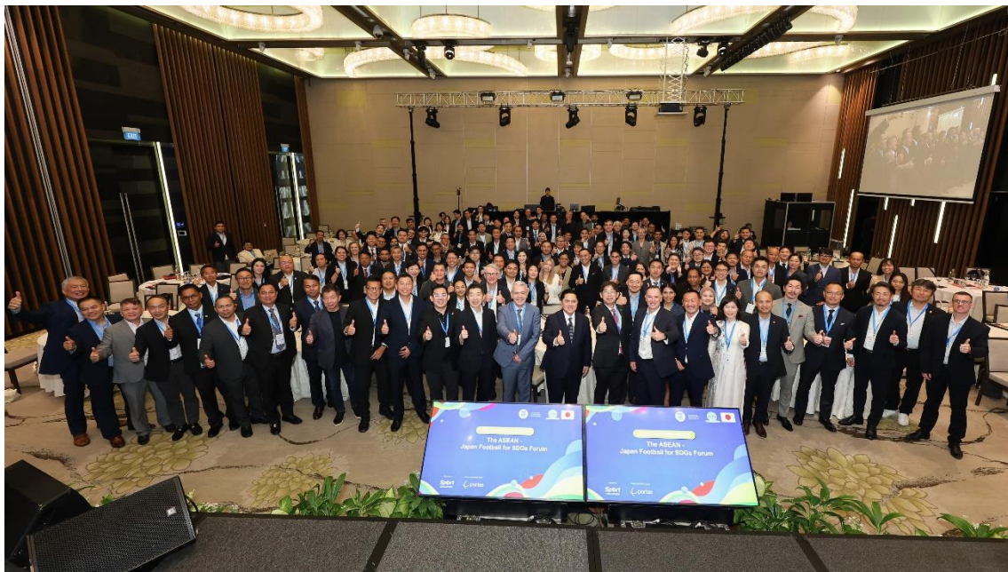
ASEAN-Japan Football4SDGs Forum

In his speech , the Secretary-General reflected on the history of ASEAN-Japan cooperation and highlighted recent developments, including non-conventional security issues such as cybersecurity and infectious diseases, the ASEAN Outlook on the Indo-Pacific (AOIP), trade frameworks like AJCEP and RCEP, the ASEAN-Japan Economic Co-Creation Vision, as well as next-generation exchange programmes such as JENESYS. He also encouraged the students to seize the opportunity presented by Expo 2025 to contribute to the future of ASEAN-Japan cooperation and exchange. I believe this lecture was a truly valuable experience for the students.