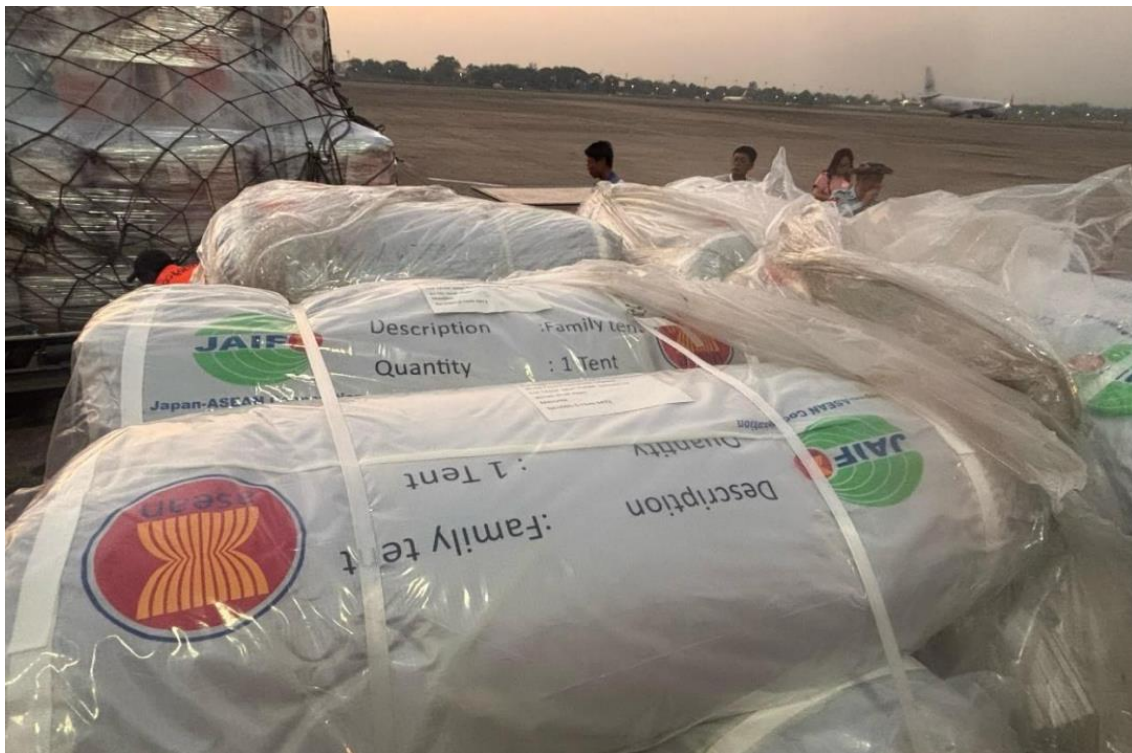
Humanitarian Relief Items from Japan that arrived in Yangon (30 March 2025, at Yangon international Airport,)

In this edition of the newsletter, I would like to introduce the progress of ASEAN-Japan cooperation, focusing on ASEAN-related events at the Expo 2025 Osaka, Kansai, Japan.