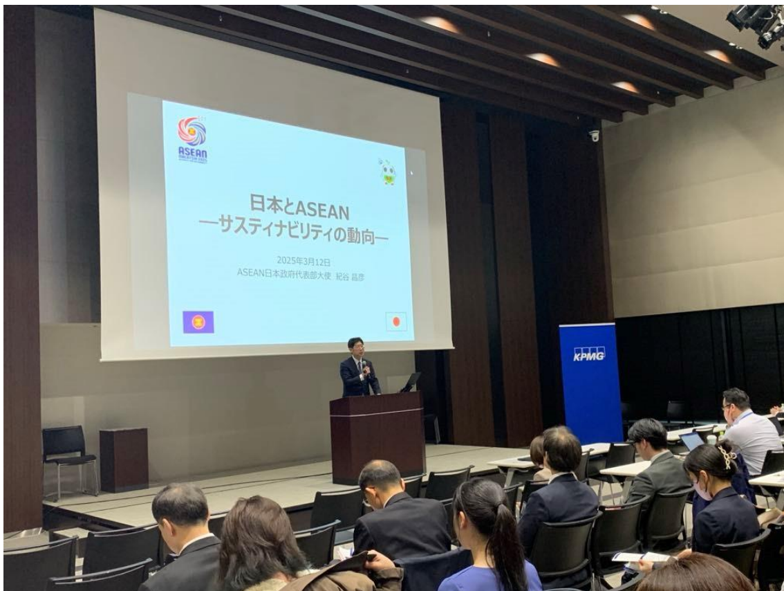
Sustainability Management Seminar (12 March 2025, in Otemachi, Tokyo)

During my trip to Japan, I also exchanged views with a wide range of stakeholders involved in ASEAN-Japan cooperation. On 7 March, I gave a presentation at the "Meeting on Business and Human Rights" hosted by the Research and Training Institute of the Ministry of Justice of Japan, and it was a valuable experience to gather information from a wide range of related organisations. After returning to Jakarta, I exchanged views with organisations related to business and human rights at my residence and created a smartphone contact group with them.