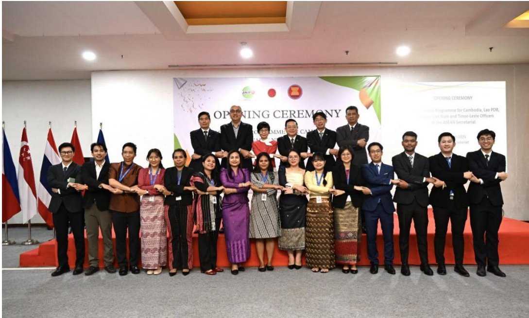
IAI Attachment Programme Opening Ceremony (17 March 2025, at ASEAN Headquarters/Secretariat)