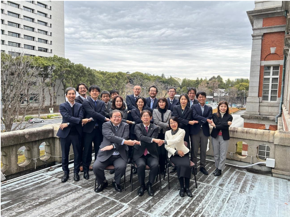
Meeting on Business and Human Rights

At this forum, participants exchanged views on the progress of concrete cooperation in line with the ASEAN-Japan Joint Vision Statement and Implementation Plan adopted in 2023, as well as on ways to further strengthen future relations in regional and international contexts. The day before the meeting, Karuizawa experienced heavy snowfall, and the meeting was held surrounded by snow—an unusual sight in Southeast Asia. After the meeting, an optional excursion was organised to deepen friendships.