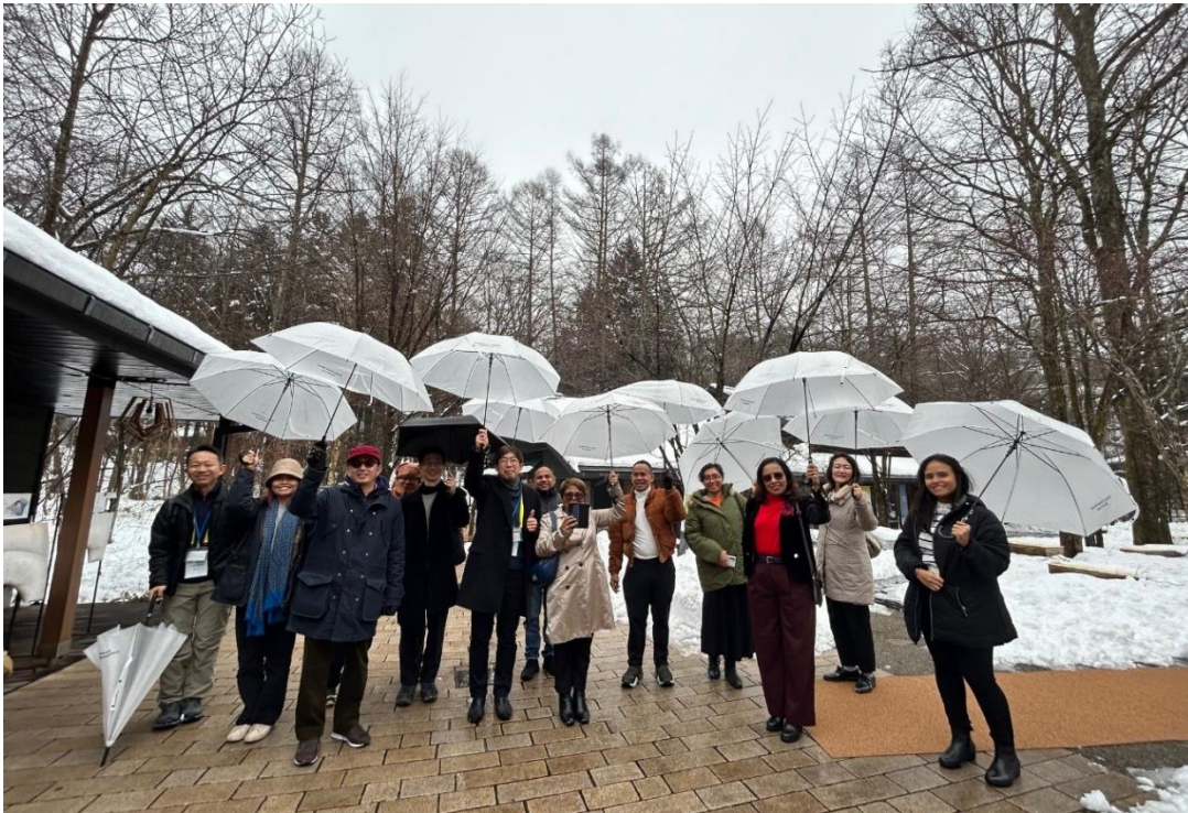
The excursion after the ASEAN-Japan Forum (5 March 2025, at the Harunire Terrace in Karuizawa)

As the world is drastically changing, I consider that it is important for ASEAN and Japan to share values and principles as well as tangible benefits in order to further advance our cooperation. In this edition of the newsletter, along with the series of meetings and events that took place this month, I would also like to consider together with you the sharing of principles and benefits between ASEAN and Japan.