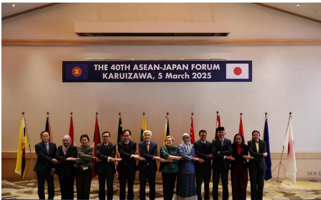
ASEAN-Japan Forum (5 March 2025, in Karuizawa)

Greetings to you all! How are you doing? Here in Jakarta, the month of Ramadhan (the fasting month) in March is almost over, and we are about to enter the long Lebaran holidays (the festival marking the end of Ramadan). I took a long business trip to Japan in the first half of this month, and in the second half I attended various events and meetings in Jakarta. I believe I could further advance ASEAN-Japan cooperation across a wide range of areas and make progress in preparing for this year's ASEAN-related meetings.