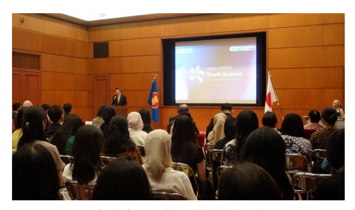
Opening Ceremony of Japan-ASEAN Youth Summit (20 February 2025, at the Mission of Japan to ASEAN office)

I believe this project is truly a typical example of ASEAN-Japan co-creation to address economic and social challenges. I would like to continue following up on it.