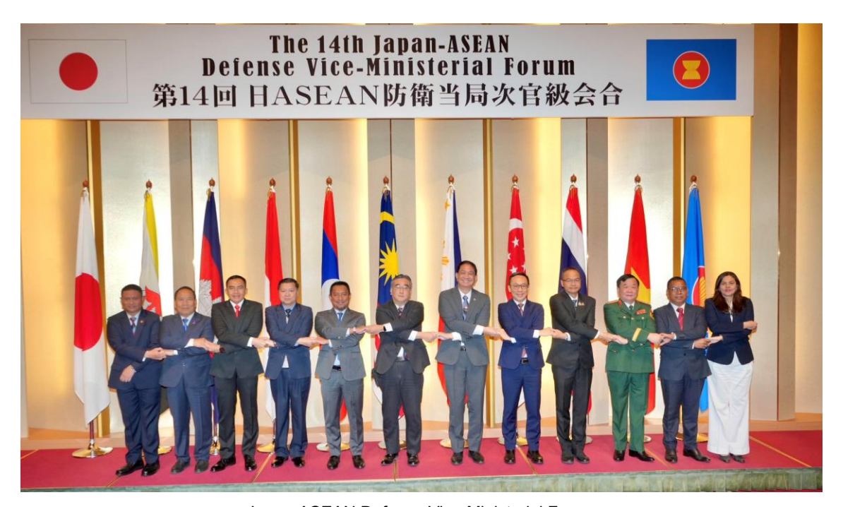
Japan-ASEAN Defense Vice-Ministerial Forum (11 February 2025, in Fukuoka,)

This month, I feel that the exchange programs related to "Heart-to-Heart Partners across Generations" have made significant progress. In this edition of the newsletter, I would like to reflect on the series of meetings and events that took place this month, and together, consider the importance of people-to-people exchanges between Japan and ASEAN.