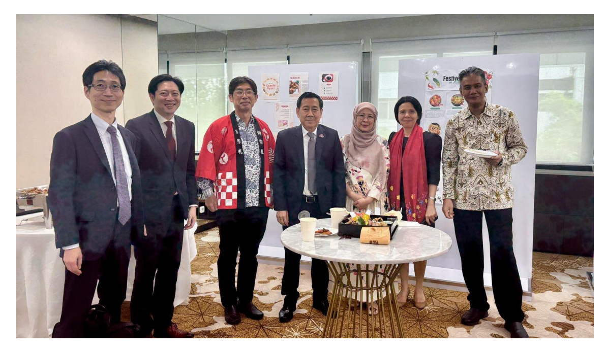
Japanese Food Event

The Expo 2025 Osaka, Kansai, Japan is also positioned as one of the "Heart-to-Heart Partners across Generations" items in the implementation plan of the ASEAN-Japan Joint Vision Statement. From now on, we will actively be promoting the expo.