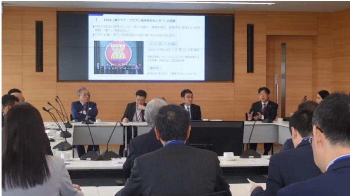
Visit of JCCI and TCCI Economic Mission to ERIA (24 January 2025, at E-DISC)

As ASEAN's regional cooperation and ASEAN-Japan cooperation deepen, the possibilities for collaboration with international organizations are expanding. I would like to take advantage of this meeting in forming further projects in the future.