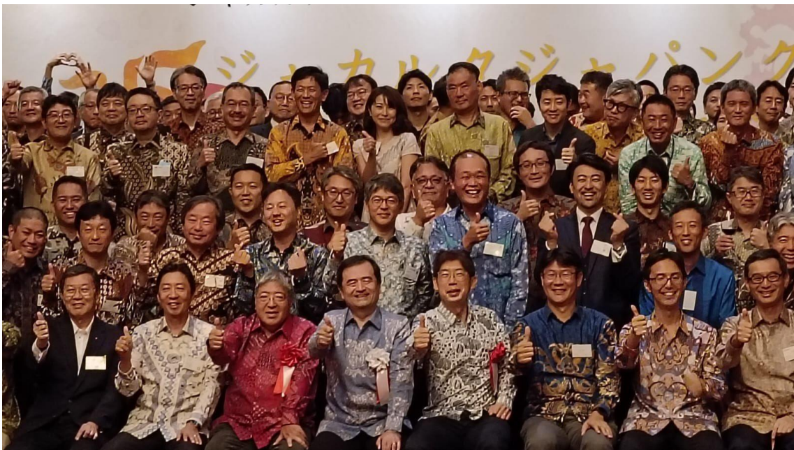
JJC Corporate Division New Year's celebration & Exchange Meeting with JCCI and TCCI Economic Mission (24 January 2025, at a hotel in Jakarta)