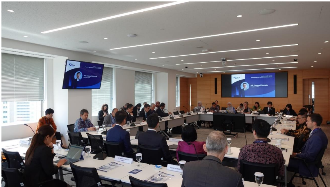
ERIA Trade and Industrial Policy Roundtable (15 January 2025, at E-DISC)

During this visit, not only did we achieve a variety of outcomes in each country, from security and economy to regional and international affairs, but we were also able to build personal relationships at the summit level through small-group meetings, extended meetings, and luncheons with the Prime Ministers' spouses.