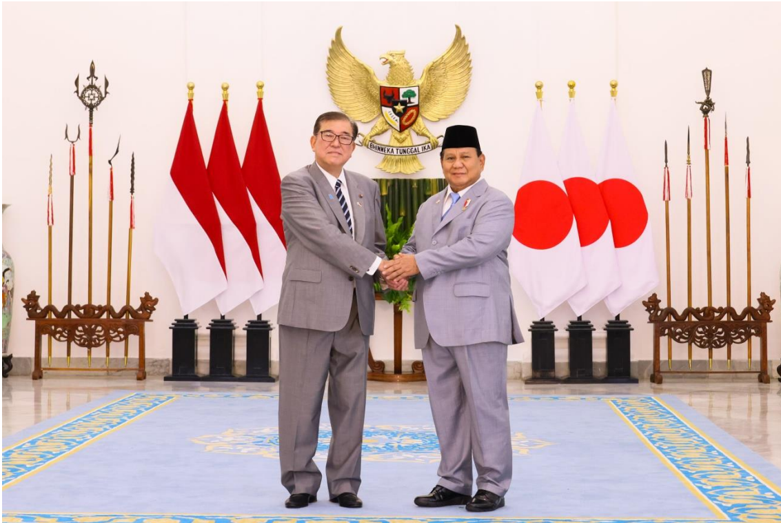
A commemorative photo taken before the Indonesia-Japan Summit Meeting

Our priority issue that we have been working on since the new year is to "bring ASEAN-Japan co-creation into reality in all fields." In this newsletter, I would like to introduce the steady progress made in ASEAN-Japan co-creation, along with a series of events in January.