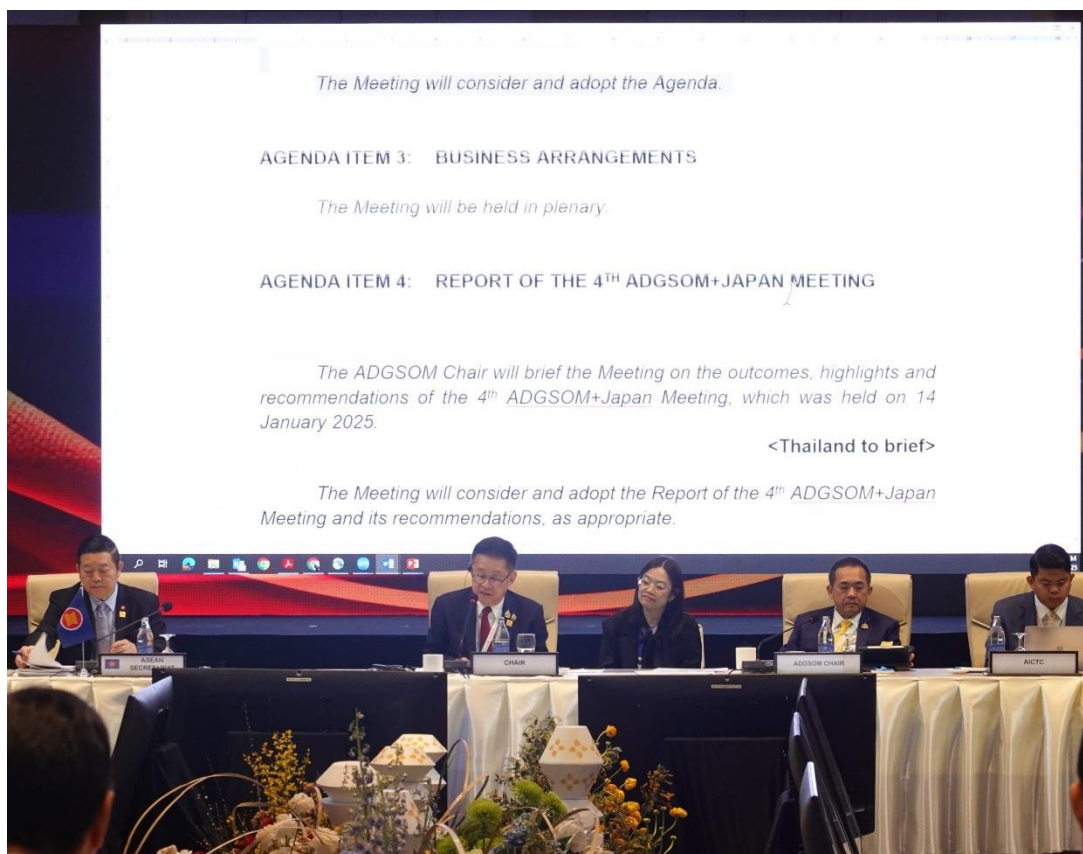
ASEAN- Digital Ministers' Meeting with Japan

By participating in this roundtable throughout the day, I was able to deepen my understanding of the policy challenges and countermeasures facing ASEAN and the Indo-Pacific region. The ERIA School of Government aimed to disseminate policy with ASEAN as the "Epicentrum of Governance" and to envision and share "Regional Interest" that goes beyond "National Interest". I fully support this initiative.