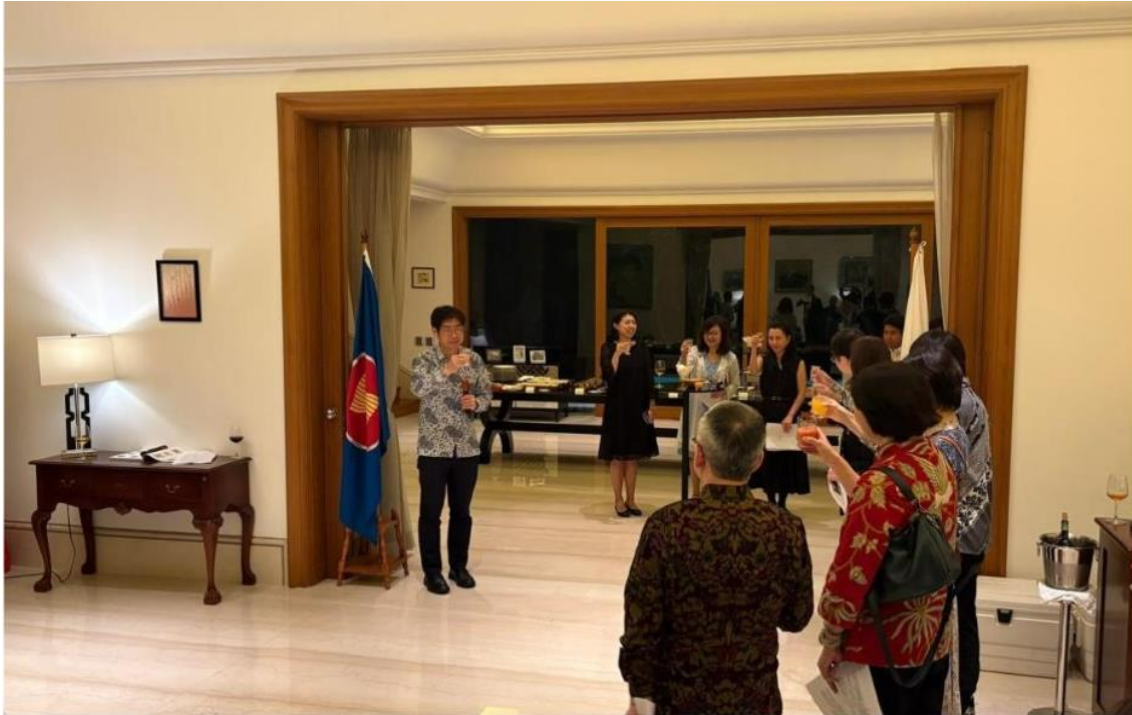
Exchange of views with Japanese Staff of International Organizations in Jakarta (16 January 2025, at the Residence of the Ambassador of Japan to ASEAN)