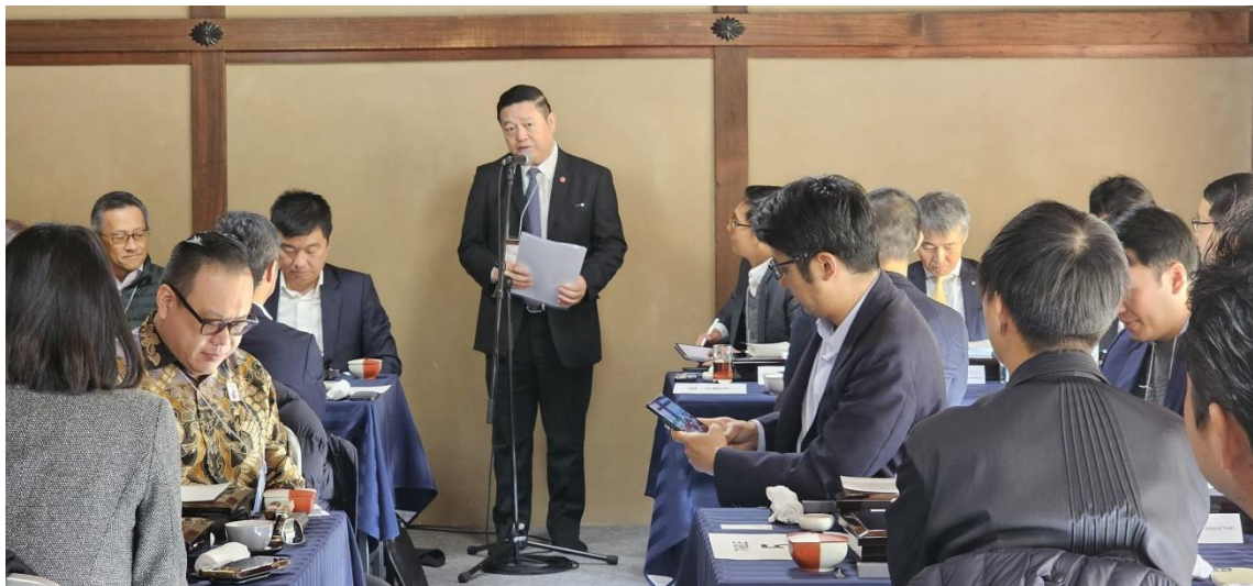
Lunch with the ASEAN-Japan Young Business Leaders/Future Generation Business Leaders' Summit (19 December 2024, at Nijo Castle, Kyoto,)

Having been present at many of the series of events, I realised that ASEAN-Japan cooperation in a wide range of fields and its achievements and practical benefits are truly Japan's strengths. In particular, ASEAN has great expectation of Japan in cutting-edge technologies such as digital, AI and decarbonisation. In maintaining and strengthening the momentum of the 50th anniversary of ASEAN-Japan friendship and cooperation, I found it very meaningful to promote discussions on specific cooperation directions and ideas with various stakeholders on the occasion of the ASEAN Secretary-General's visit to Japan. Next year, the Expo 2025 Osaka-Kansai will be held in Osaka. I hope that the next Secretary-General's visit to Japan will be realised at the earliest opportunity and that cooperation will make further progress.