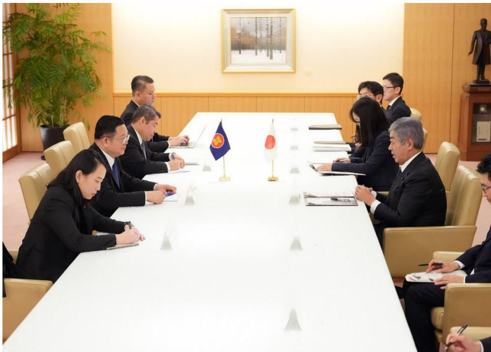
Meeting between Foreign Minister H.E. Mr. IWAYA and ASEAN Secretary-General H.E. Dr. Kao Kim Hourn (18 December 2024, at the Ministry of Foreign Affairs Japan)

This dialogue was also published in Malaysia, the ASEAN Chair for next year. I hope that this dialogue will be an opportunity to make steady progress on future cooperation.