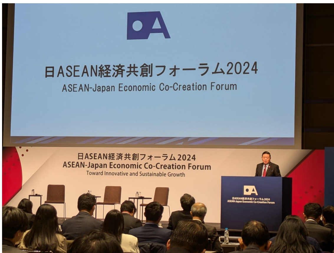
ASEAN-Japan Economic Co-Creation Forum 2024 (20 December 2024, in Tokyo,)

How are you doing as the year draws to a close? It has already been a year since the ASEAN-Japan 50 th Year Commemorative Summit was held in Tokyo in December last year with great fanfare!