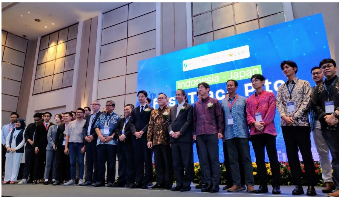
Indonesia-Japan Fast Track Pitch (5 December 2024, in Jakarta)

The protection of intellectual property rights in the ASEAN region is an important issue for the further development of business between ASEAN and Japan in the future. The ASEAN-Japan Joint Statement for Intellectual Property 2024 , and The ASEAN-Japan Intellectual Property Action Plan 2024-2025 adopted at The ASEAN-Japan Heads of Intellectual Property Offices Meeting (in Brunei Darussalam) in September this year, and the Joint Statement and The ASEAN-Japan Work Plan on Law and Justice adopted at the ASEAN-Japan Special Meeting of Justice Ministers (in Tokyo) in July last year, also confirmed the promotion of cooperation in this field.