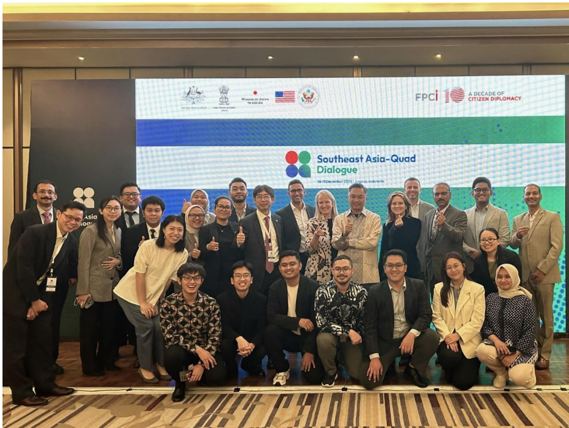
Southeast Asia-Quad Dialogue (11 December 2024, in Jakarta)