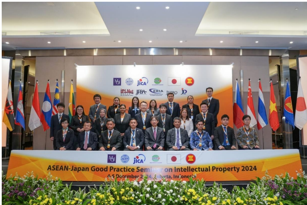
ASEAN-Japan Good Practice Seminar on Intellectual Property

I am pleased that the Japanese Ministry of Defence, together with the Indonesian and other ASEAN Defence Ministries, is actively contributing to the realisation of a “free and open Indo-Pacific” by supporting the ASEAN-led framework and the AOIP, while further strengthening cooperation with other countries.