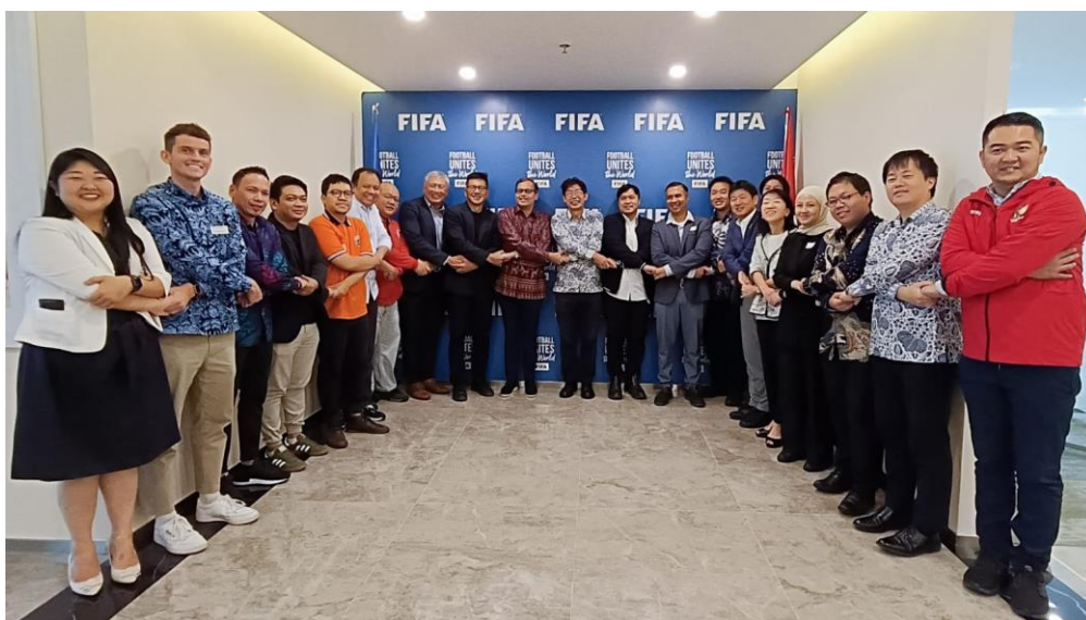
ASEAN Football4SDGs Workshop (26 September 2024, at FIFA Indonesia office)