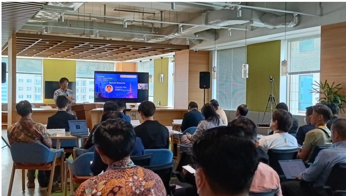
Indonesia-Japan Fast Track Pitch Launch Event (26 September 2024, at E-DISC)

I also expressed my appreciation for ERIA's progressive initiatives, including the E-DISC, the Asia Zero Emissions Center and the ERIA School of Government, and my hope that Japan and a wide range of partners will further deepen their cooperation with ERIA. On 18 September, the ERIA School of Government, promptly held a Leadership Forum with former Indonesian President Yudhoyono invited. I look forward to further encouraging ERIA's wide-ranging activities and new initiatives.