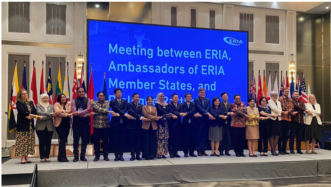
ERIA Ambassadors' Meeting (12 September 2024, at a hotel in Jakarta)

The FOIP training is being implemented by the United Nations Institute for Training and Research (UNITAR) with support from Japan. The first phase of the training, which lasted until the end of August this year, involved more than 400 participants, who completed a two-month online training course; the second phase included face-to-face training for about 80 participants from the Asia region in Jakarta this month and about 80 from the Pacific region in Fiji in October; and the third phase is scheduled for February next year in Japan for 50 participants selected from both regions.