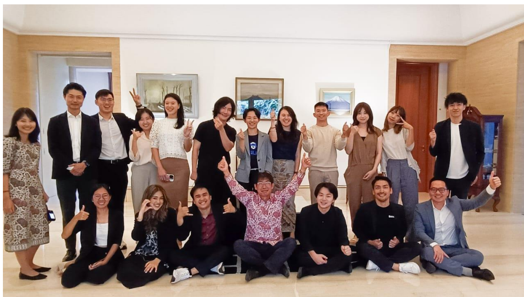
Meeting with the participants of the pre-event for ASEAN-Japan Future Gen Business Leaders' Summit (25 September 2024, at the residence of the Ambassador of Japan to ASEAN)

How did you spend your time in September? In Jakarta, the Mission of Japan to ASEAN has been promoting ASEAN-Japan cooperation in a wide range of fields while attending various meetings at the ASEAN Headquarters and Secretariat and consultations with national delegations. In Vientiane, the ASEAN Economic Ministers' Meetings and Related Meetings and the ASEAN Ministers on Energy Meetings and Related Meetings were convened, and the ASEAN Business and Human Rights Workshop took place in Bangkok.