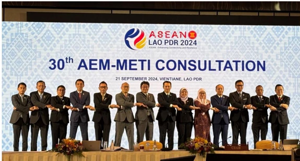
ASEAN-Japan Economic Ministers' Meeting

ASEAN-Japan cooperation on business and human rights issues will make a significant contribution to the economic and social development of both ASEAN and Japan. We will continue to make our efforts.