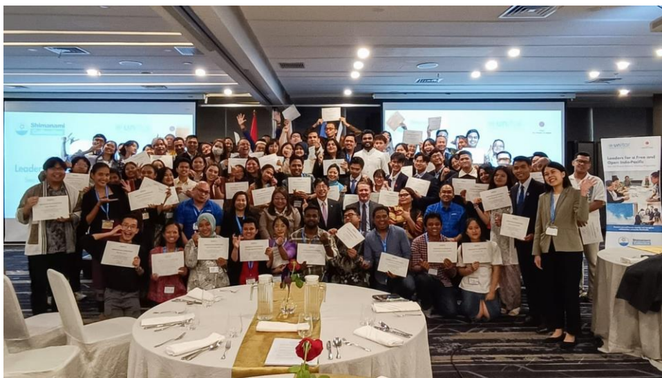
Closing ceremony for the Jakarta workshop of the “Leaders for a Free and Open Indo-Pacific: Sea and Human Security” training programme (19 September 2024, at a hotel in Jakarta)

In this edition of the Ambassador's Newsletter, I would like to report on a series of these meetings and events to discuss future directions with you.