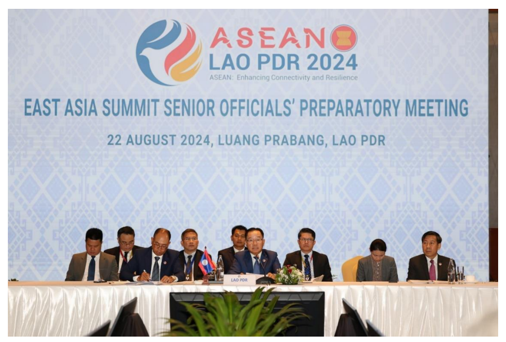
East Asia Summit Preparatory Senior Officials' Meeting (EAS Prep-SOM) (22 August 2024, in Luang Prabang, Lao PDR,)

The <u>2nd AZEC Ministerial Meeting</u> was held in Jakarta on 21 August, where a <u>Joint Statement</u> was adopted, a launch ceremony for the newly established <u>Asia Zero Emission Centre</u> at the Economic Research Institute for ASEAN and East Asia (ERIA) took place, about 70 relevant Memorandum of Understanding (MOU) were publicised, and the MOU for cooperation between METI, ADB and ERIA was signed. Preparations are underway to hold the 2nd AZEC Summit Meeting on the occasion of the ASEAN-related Summit Meetings to be held in Vientiane in October this year.