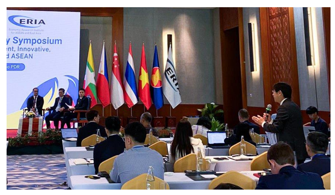
Questions at the ASEAN Connectivity Symposium (23 August 2024, in Luang Prabang, Lao PDR)

In the morning of 22 August, the <u>ASEAN +3 Preparatory Senior Officials' Meeting</u> (<u>APT Prep-SOM</u>) and the <u>East Asia Summit Preparatory Senior Officials' Meeting</u> (<u>EAS Prep-SOM</u>) were held, and a welcome dinner and numerous bilateral SOM consultations took place before and after the Prep-SOMs. With only a month and a half to go before the Summit Meetings, these meetings provided a useful opportunity to receive updates from the Chair on the concrete arrangements and the direction of the outcome documents, as well as to listen to the views and positions expressed by participating countries.