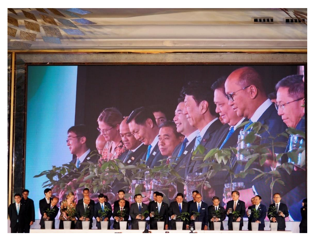
Asia Zero Emission Centre launch ceremony (21 August 2024, in Jakarta)