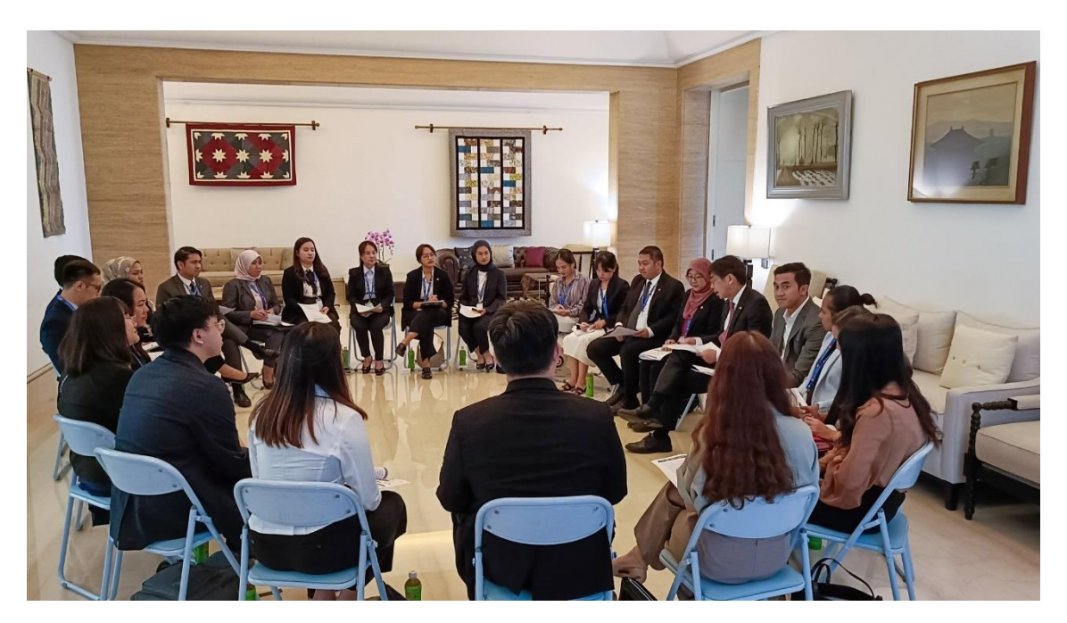
Exchange of views on ASEAN-Japan cooperation with AJFP participants (14 August 2024, at the residence of the Ambassador of Japan to ASEAN)

Since the adoption of <u>UN Security Council Resolution 2250</u> on <u>Youth, Peace and Security (YPS)</u> in 2015, <u>initiatives on YPS</u> have gradually progressed in the ASEAN arena. Based on the Implementation Plan for the 50th Year of ASEAN-Japan Friendship and Cooperation, Japan has initiated cooperation on YPS for the first time. We would like to support ASEAN's efforts on YPS as well as Women, Peace and Security (WPS) in various ways in the future.