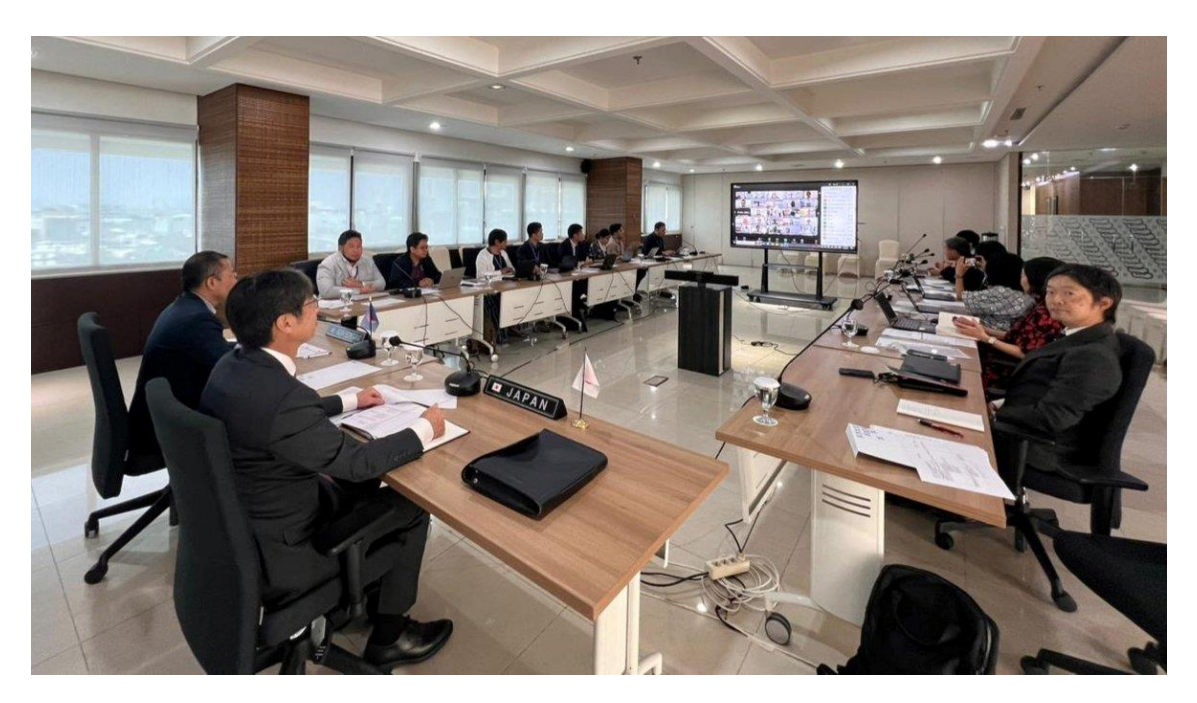
The First ASEAN-JICA Food Value Chain Joint Coordination Committee (JCC) (9 July 2024)

The next morning has the Group Meeting followed by the retreat session, in which the chairperson presented critical issues opened for discussion. It was a great opportunity to deliberate on specific future initiatives and roles Japan should play in order to contribute to the ASEAN-led framework to bring peace, stability, prosperity.