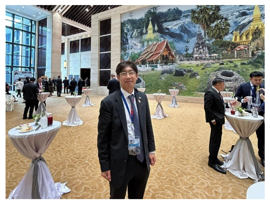
The Delegation Lounge at the ASEAN-related Foreign Ministers' Meetings (26 July 2024)

Foreign Minister KAMIKAWA Yoko attended many meetings. On 26 July, <u>the ASEAN-Japan Foreign Ministers' Meeting</u> and <u>the Mekong-Japan Foreign Ministers' Meeting</u>. The next day 27 July, <u>the ASEAN+3 (APT) Foreign Ministers' Meeting</u>, <u>the EAS Foreign Ministers' Meeting</u> and <u>the ARF Ministerial Meeting</u>, as well as bilateral meetings with Lao PDR, China, ROK, Indonesia, Norway, the UK, Singapore and Timor-Leste.