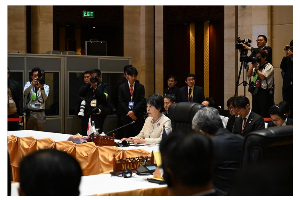
ASEAN-Japan Foreign Ministers' Meeting (26 July 2024,)

Entering the second half of 2024 with one of ASEAN's main events: the 57th ASEAN Foreign Ministers' Meeting and related meetings, held in Vientiane, Laos, in late July. I travelled to Vientiane and was reminded of the significance of a regional framework that brings together Foreign Ministers of ASEAN and Dialogue Partners to promote dialogue and cooperation on a wide range of issues, from security to economic and social issues.