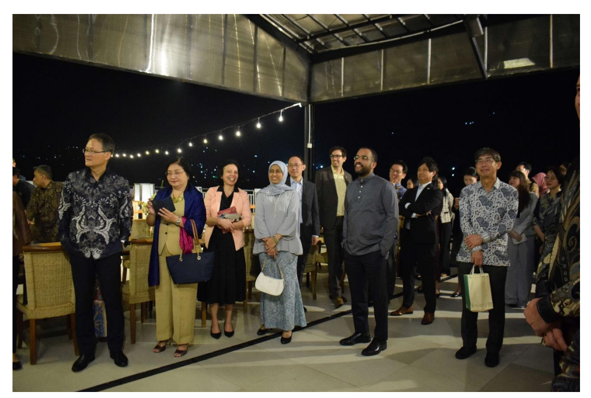
Welcome Dinner at EAS Group Meeting and Retreat (3 July 2024,)

In this edition of the Ambassador's Newsletter, I would like to report a series of meetings and events, including the ASEAN-related Foreign Ministers' Meetings, and reflect on their outcomes and significance with you.