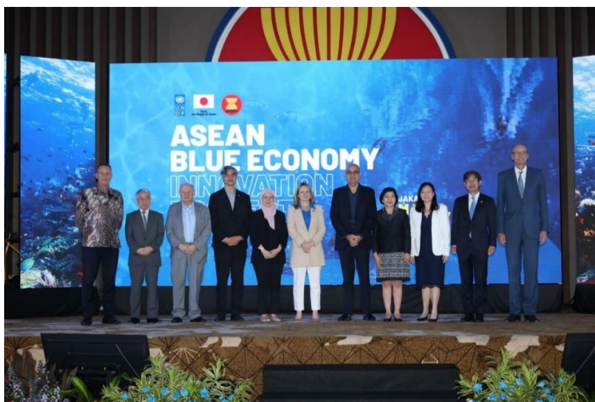
ASEAN Blue Economy Innovation Project Launching Ceremony