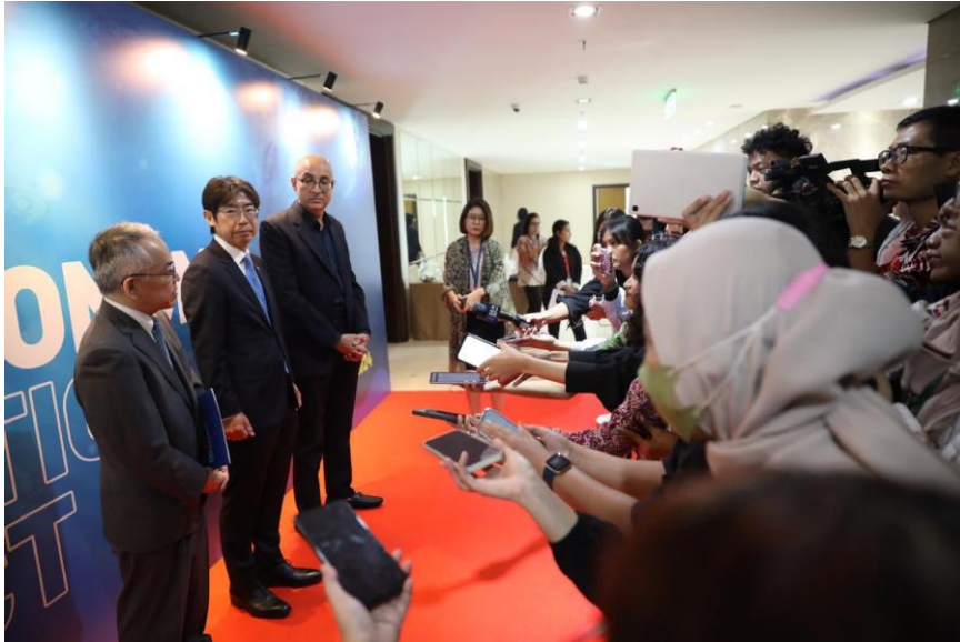
ASEAN Blue Economy Innovation Project Press Conference