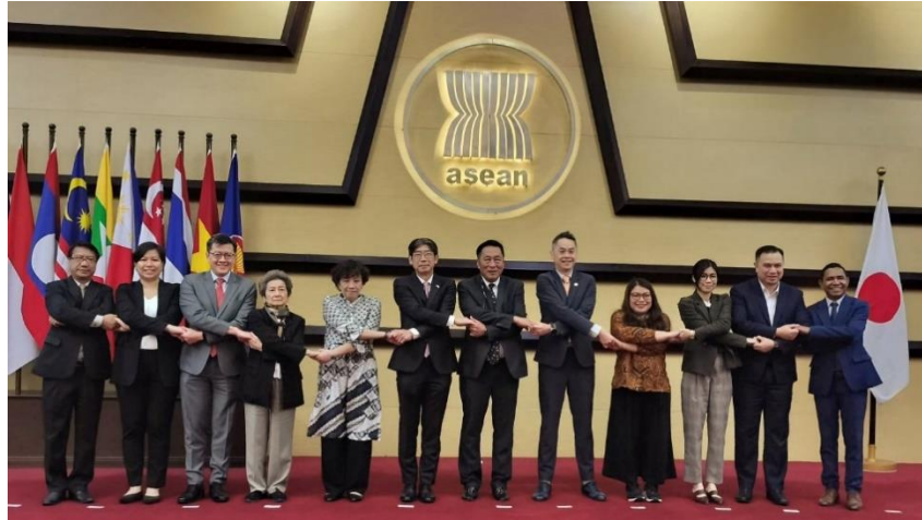
Third AICHR-Japan Interface Meeting (22 May 2024)