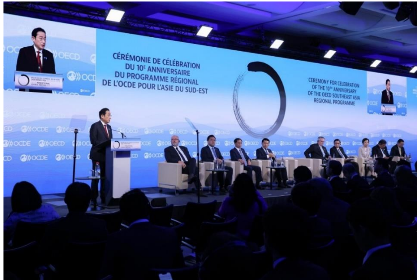
OECD Southeast Asia Regional Programme (SEARP) 10 th Anniversary Celebrations (2 May 2024)