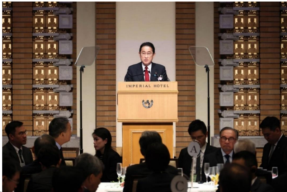
Prime Minister Kishida's speech at the Nikkei Forum 'Future of Asia' dinner