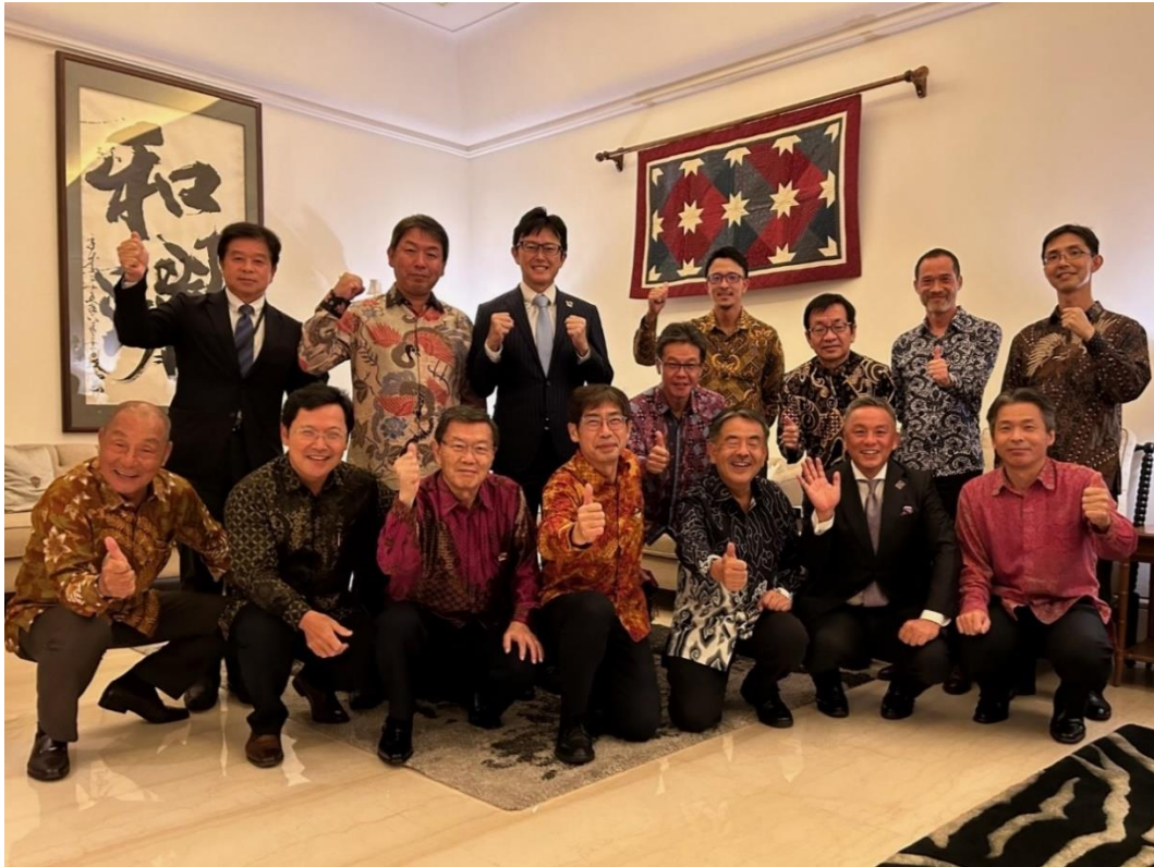
Roundtable meeting with the ASEAN-Kai (8 December 2023).

On 8 December, I invited the members of the ASEAN-Kai to my official residence for discussion and preparation ahead of the Commemorative Summit. The ASEAN-Kai is a community of Japanese companies in Jakarta to enhance ASEAN-Japan cooperation, started in 2011 when the Mission of Japan to ASEAN was established.