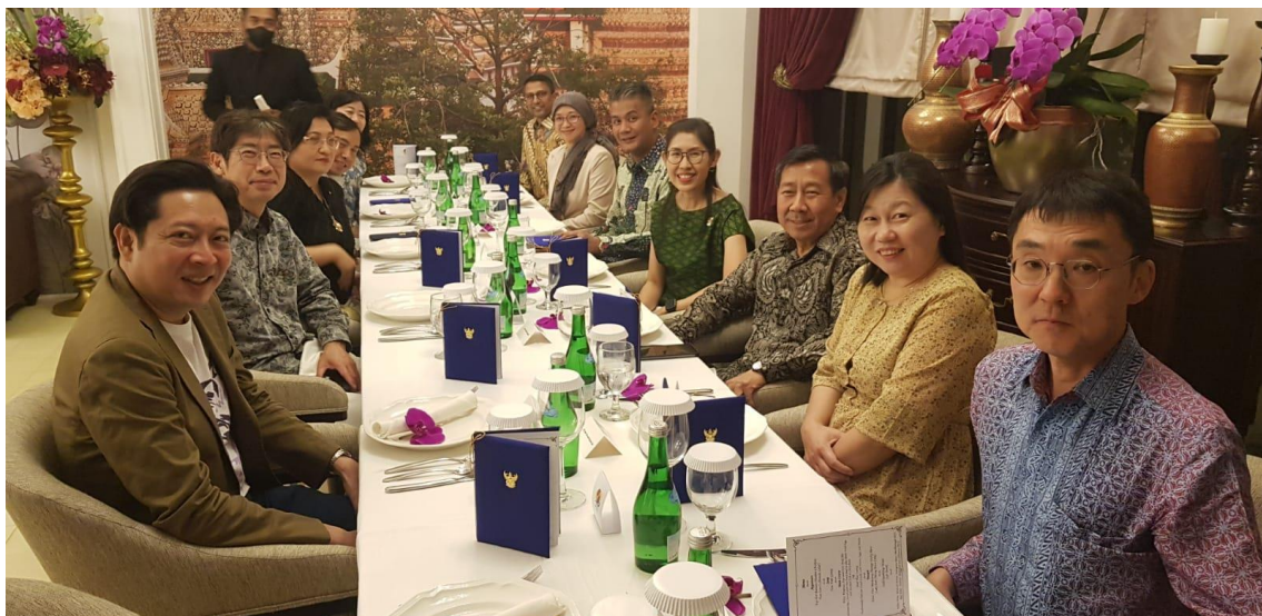
Celebration Dinner on the 50 th Year of ASEAN-Japan Friendship and

During the ASEAN-Japan Commemorative Summit, Prime Minister KISHIDA and Minister KAMIKAWA Yoko held bilateral summits and foreign ministers' meetings , whilst Mrs. KISHIDA Yuko and other leaders spouses met with students and watched Noh performance under the Partners Programme. Minister KAMIKAWA Yoko also held a dialogue on Women, Peace and Security (WPS) with Indonesian Foreign Minister H.E. Retno Marsudi.