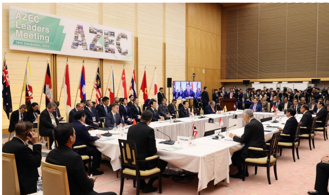
Asian Zero Emissions Community (AZEC) Summit (18 Dec 2023,)

In the evening, a lighting ceremony of the Tokyo Tower in the colours of ASEAN flag - red, yellow and blue – took place, attended by Prime Minister KISHIDA and his spouse, ASEAN leaders and their spouses, participants of the ASEAN-Japan Student Conference and students from ASEAN countries studying at the National Defence Academy of Japan. This was followed by a gala dinner hosted by the Prime Minister KISHIDA and his spouse, attended by about 200 people, including ASEAN leaders and their spouses, as well as persons concerned from political parties, related organisations, private companies, and cultural figures, who enjoyed performances and cuisines that represents Japanese tradition.