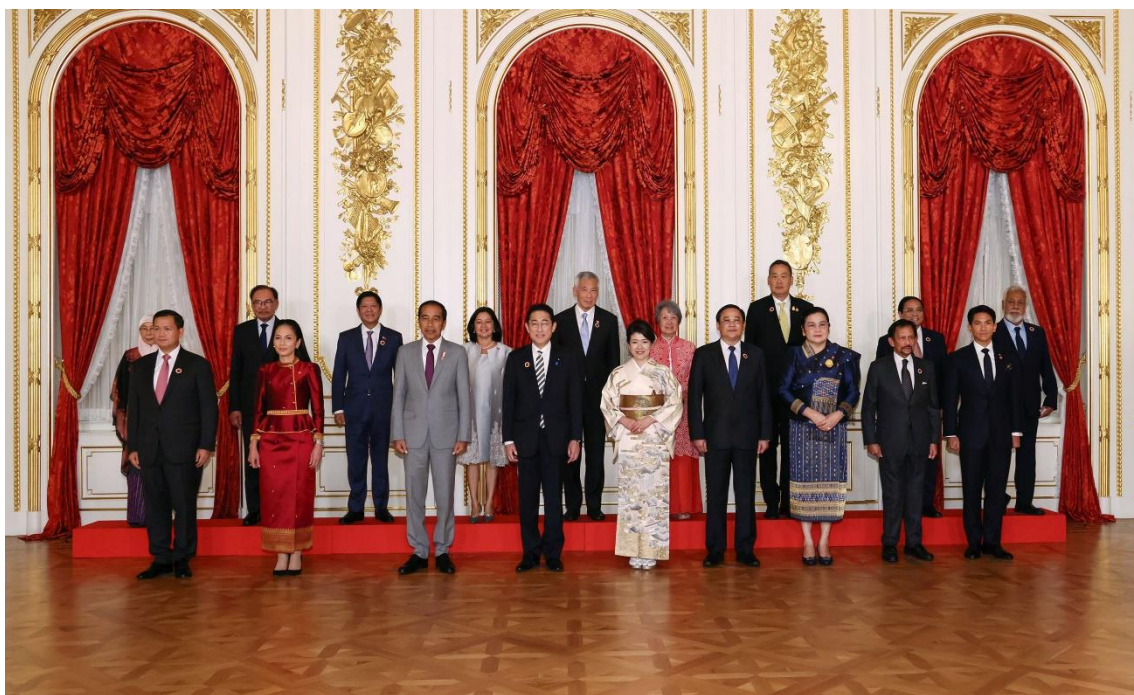
The Commemorative Summit for the 50th Year of ASEAN-Japan Friendship and Cooperation Banquet hosted by Prime Minister KISHIDA and Mrs. KISHIDA (16 December 2023,)

From 16-18 December, the Commemorative Summit for the 50th Year of ASEAN-Japan Friendship and Cooperation was held in Tokyo. The official program started with a banquet hosted by Prime Minister KISHIDA Fumio and Mrs. KISHIDA at the State Guest House. The next day, the Commemorative Summit, a press conference and gala dinner took place at the hotel. On the last day, a luncheon hosted by economic organisations and the Tea Reception by Their Majesties the Emperor and Empress at the Imperial Palace were held. During that time, many other events, such as the Asia Zero Emission Community (AZEC) Leaders Meeting and bilateral Summit and Foreign Ministers Meetings also took place at the Prime Ministers' Office separately. I travelled to Tokyo to take charge of the negotiation for the outcome documents and attended many events, where I was able to feel the excitement of the historic meeting. A major achievement of this meeting was the adoption of a Joint Vision Statement and the Implementation