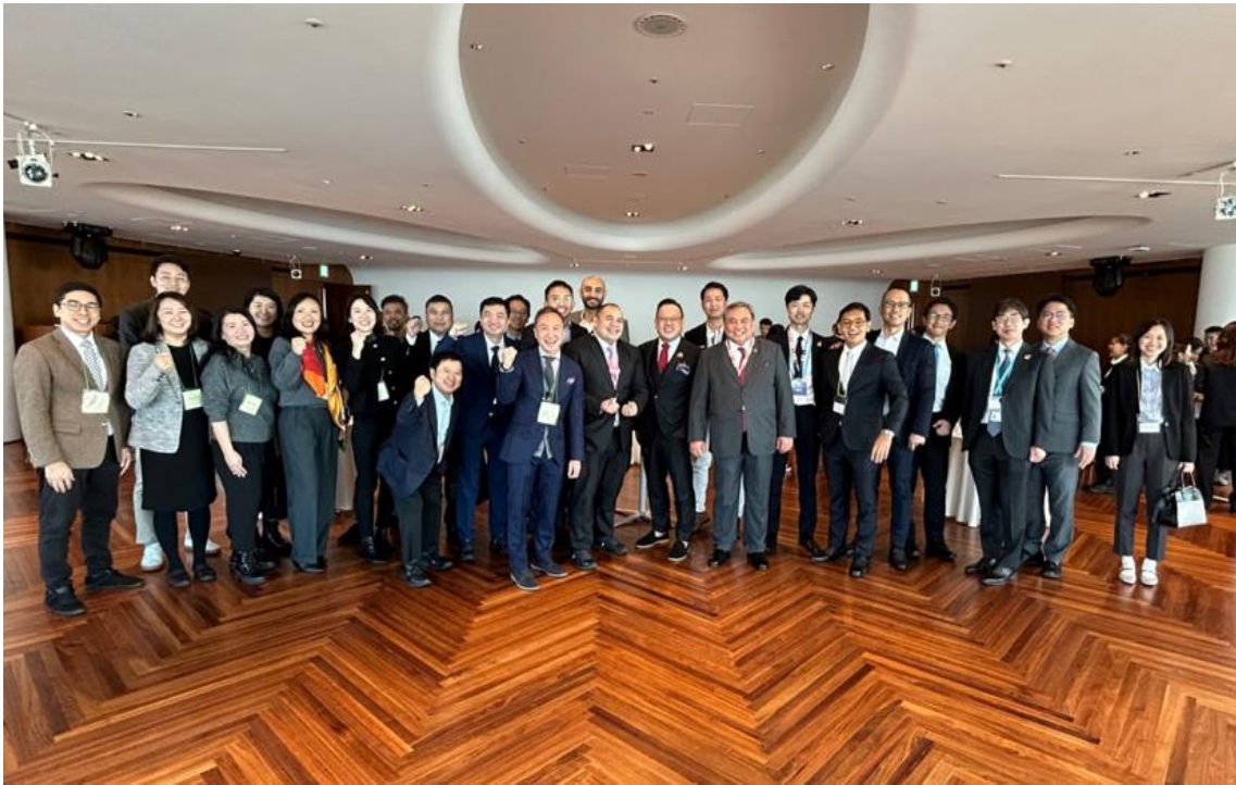
Networking lunch with Asia's Next Generation Leaders (16 December 2023).

Business is the engine in strengthening ASEAN-Japan relations. We intend to further promote such collaboration in the future.