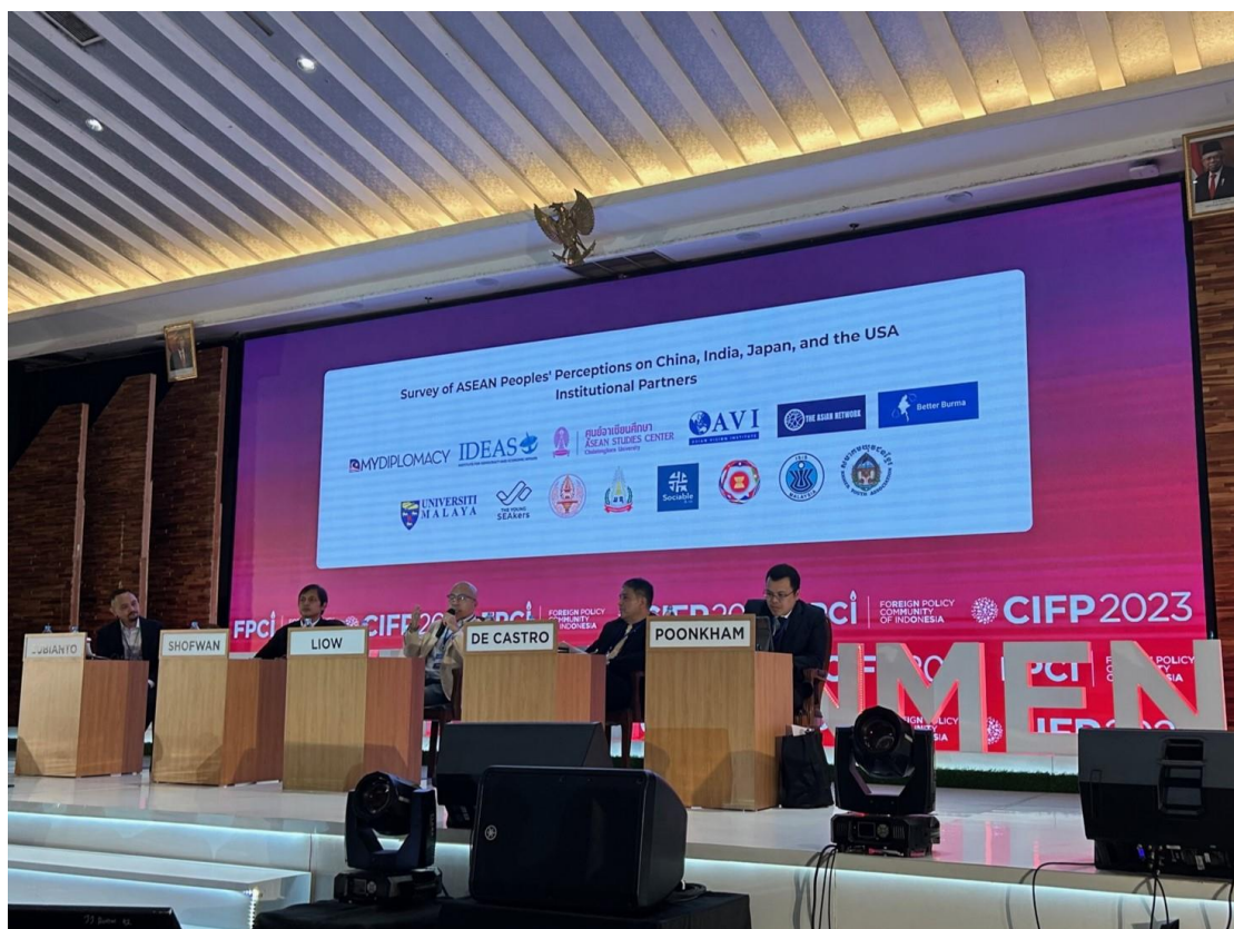
FPCI Conference on Indonesian Foreign Policy (CIFP) 2023 during 'Living Among Giants' session (2 December 2023)

Earlier this month, I also undertook other activities: attending a session on the Survey of ASEAN Peoples’ Perception on China, India, Japan, and the US; travelling to Lao PDR, the ASEAN Chair in 2024; and hosting a meeting with the ASEAN Association (ASEAN-Kai). In this edition of the Ambassador's Newsletter, I would like to review a series of events and achievements with you during this month.