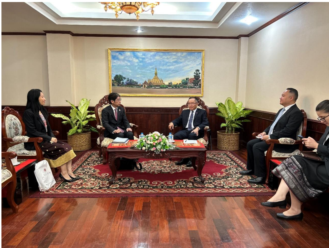
Meeting with Lao PDR Deputy Foreign Minister H.E. Mr. Thongphane SAVANPHET (5 December 2023)

I conveyed that Japan would not take this result for granted and would further strengthen our efforts on the occasion of the ASEAN-Japan Commemorative Summit to be held this month".