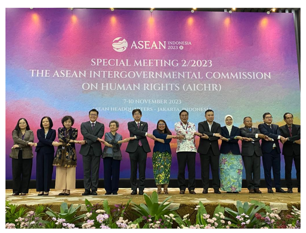
2nd AICHR-Japan Interface Meeting (8 November 2023).