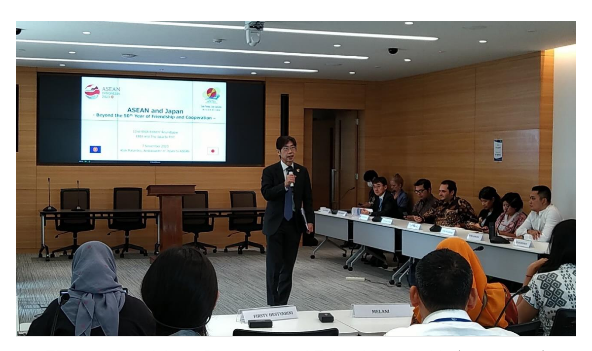
ERIA and The Jakarta Post co-hosted Editors' Roundtable (7 Nov 2023)

On the evening of the 17th, a day before Jak-Japan Matsuri, we had the opportunity to have a <u>friendly futsal match</u> between the ASEAN Secretariat team and the Japanese Embassy and Mission team. It was a great opportunity for our colleagues from our respective workplaces to show their new faces and it was a lot of fun!