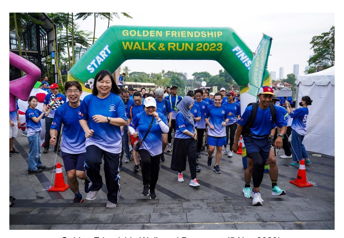
Golden Friendship Walk and Run event (5 Nov 2023).

On 28 November, the KEIDANREN (Japan Business Federation) visited Jakarta to exchange views with the Indonesian Government and the ASEAN Secretariat, and I briefed them on the latest developments. On 16 December, the <u>ASEAN-Japan Economic Co-Creation Forum</u> will be held in Tokyo. To make the most of this opportunity, the Japanese and ASEAN business organisations are accelerating their preparations.