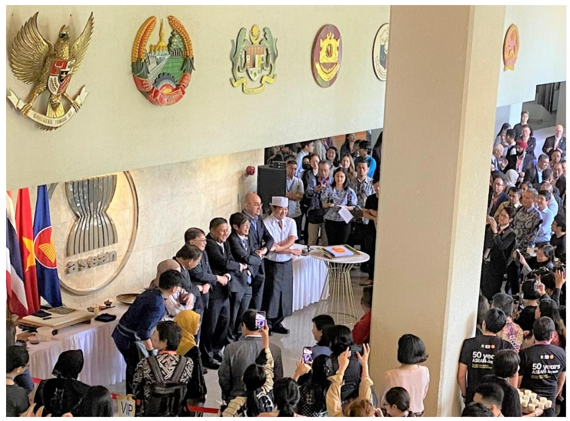
Japanese Food Event at the ASEAN Secretariat (21 Nov 2023).

The 21st ASEAN and Japan Transport Ministers Meeting also took place in Lao PDR on 10 November, where a new action plan for the next 10 years, the Luang Prabang Action Plan, was adopted.