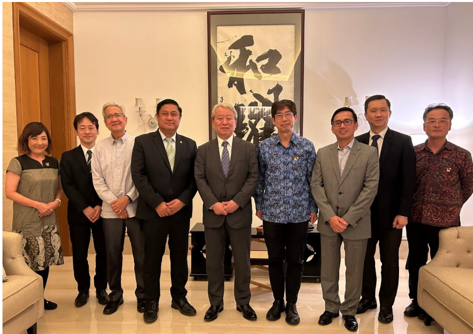
Exchange of views between the President of JICA and the ASEAN Secretariat (30 October 2023).