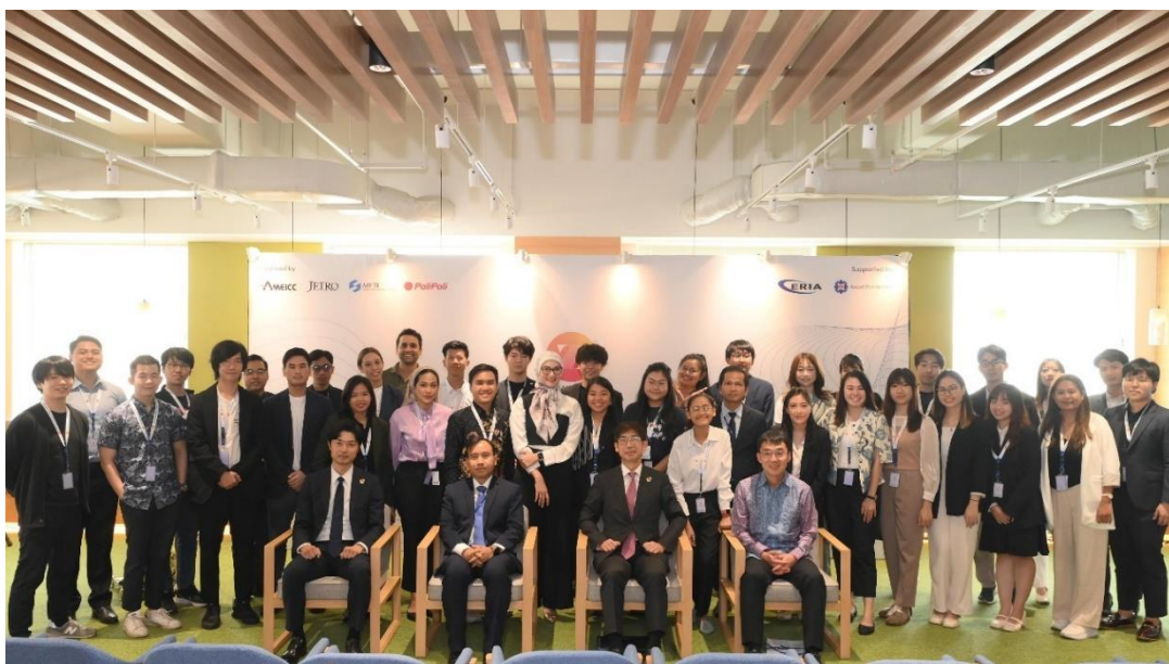
ASEAN-Japan Generation Z Business Leaders' Summit Pre-event (18 October 2023)

On 18 to 19 October, a pre-event of the ASEAN-Japan Generation Z Business Leaders' Summit was held in Jakarta, Indonesia.