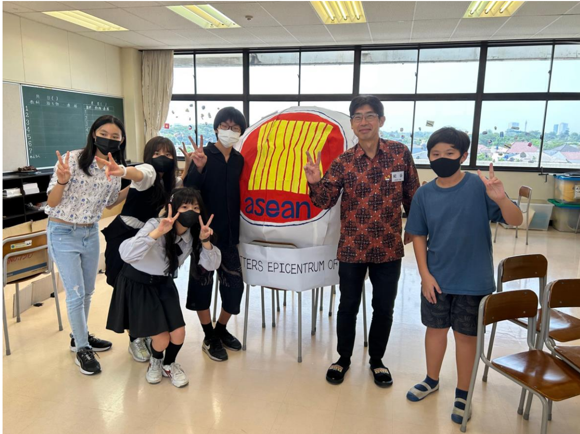
ASEAN booth at the Jakarta Japanese School (JJS) Festival (13 Oct 2023)

The ASEAN-Japan Generation-Z Leaders Community website is already up and running. NHK News also reported this event . We hope that this community of entrepreneurial exchange will develop significantly in the future and lead the way to a new era.