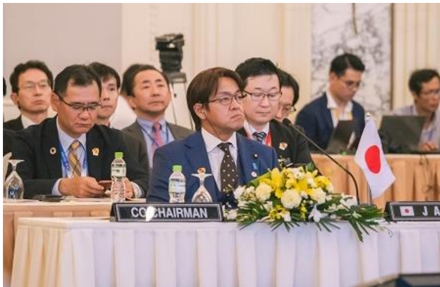
ASEAN-Japan Ministerial Meeting on Disaster Management (AMMDM+Japan)

Those selected to the ACE programme from ASEAN Member States were all fluent in English and highly competent. They explained to me accurately the actual situation of disasters and countermeasures in respective countries. Their experience of going through this programme together for a few months, combined with a study visit to Japan (an advanced country on disaster management), will become their asset for the future. Since the ACE programme started in 2014, about 120 participants have taken part in the programme and are still active in ASEAN countries.