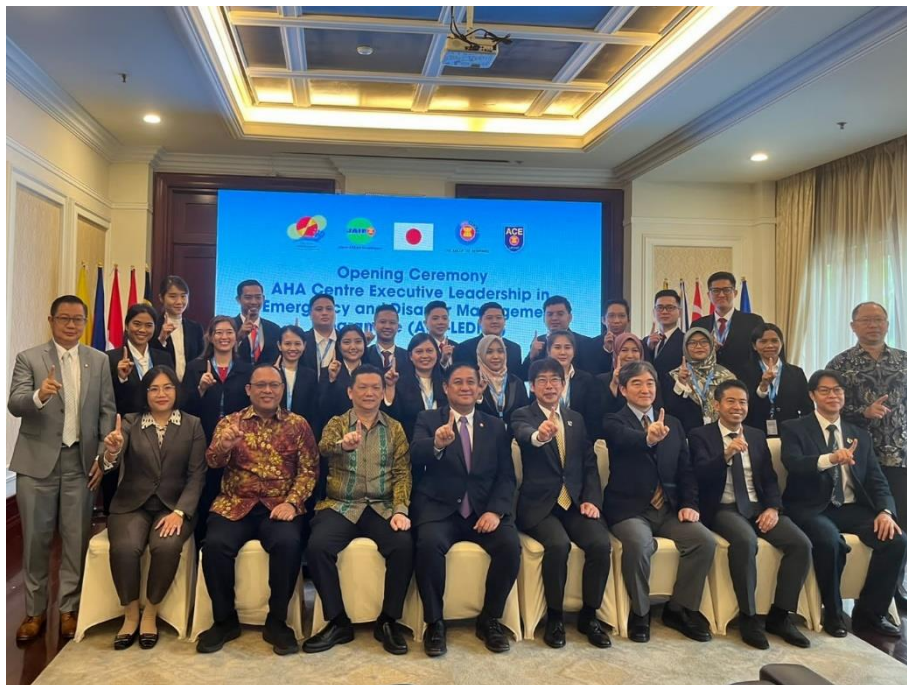
ACE programme opening ceremony (4 October 2023)

More than 1,000 people visited the fair over the three days. We hope that visitors could grasp how ASEAN-Japan cooperation contributes to the Sustainable Development Goals (SDGs) in our immediate surroundings. We would like to thank once again all the companies and organisations that cooperated with us.