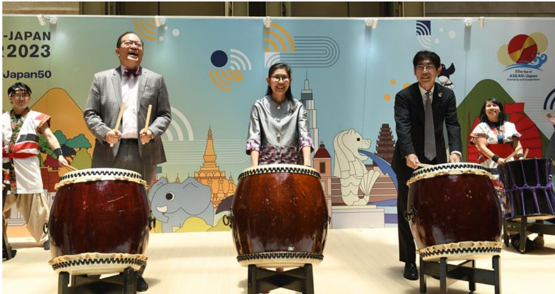
Opening ceremony of the ASEAN-Japan Fair (30 September 2023,)

Two key words, “trust” and “co-creation”, have emerged as I took part in these events and exchanged views with many so people about the values of the 50 th Year of ASEAN-Japan Friendship and Cooperation. In this edition of the Ambassador's Newsletter, I would like to introduce to you this month's events and achievements, and to think together on the importance of 'trust' and “co-creation' between ASEAN and Japan.