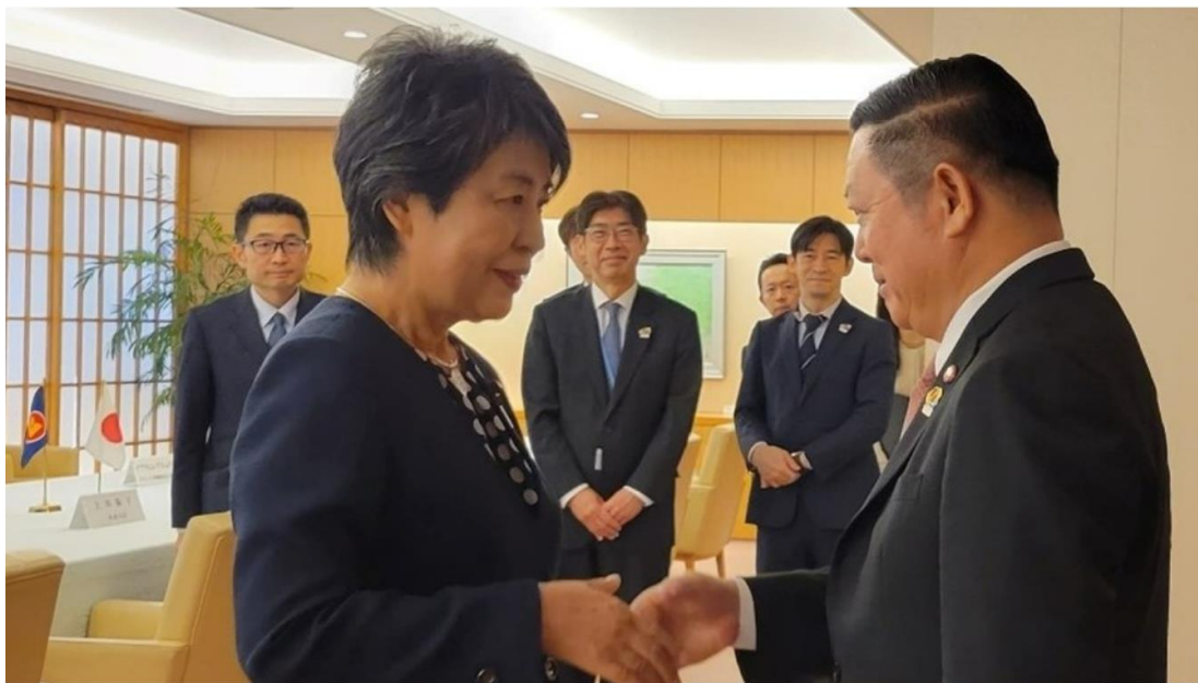
Meeting between Minister for Foreign Affairs Kamikawa and Secretary-General of ASEAN, H.E. Dr. Kao Kim Hourn. (24 October 2023)

Following up the recommendations and declaration of action they compiled last month in the integrated learning, the students themselves worked very hard and presented their own ideas at this event, which was very impressive. The future of Japan and ASEAN depends on the exchange and cooperation of the youth bearing the next generation. I would like to continue to encourage them in their efforts.