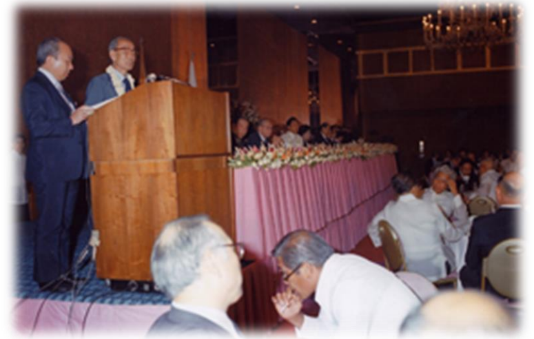
Speech by PM Fukuda in Manila on 18 August 1977