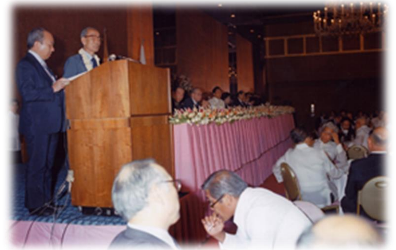
Speech by PM Fukuda in Manila on 18 August 1977