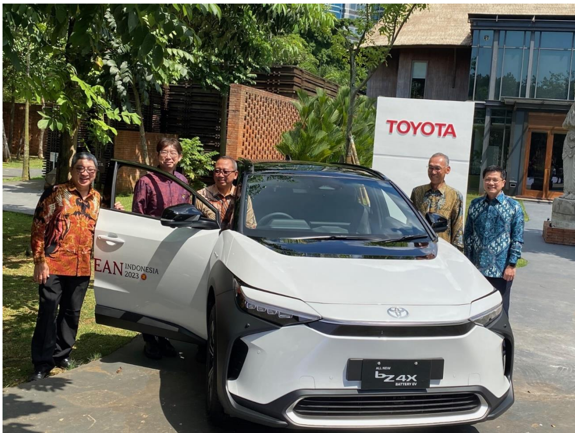
Toyota electric vehicle handover ceremony (17 April 2023).

On 12 April, Minister of Justice, H.E. Mr.SAITO Ken, held a web conference with Secretary-General of ASEAN H.E. Dr. Kao Kim Hourn . Minister Saito and Secretary-General Kao confirmed the commitment to the success of the AJSMJ, and reaffirmed to further strengthen cooperation in the field of law and justice. In addition, Minister Saito requested Secretary-General Kao to attend the AJSMJ and related meetings in-person and received a positive response. I hope that, through this next meeting taking the occasion of the 50th Year of ASEAN-Japan Friendship and Cooperation, ASEAN-Japan cooperation to promoting the rule of law in progress .