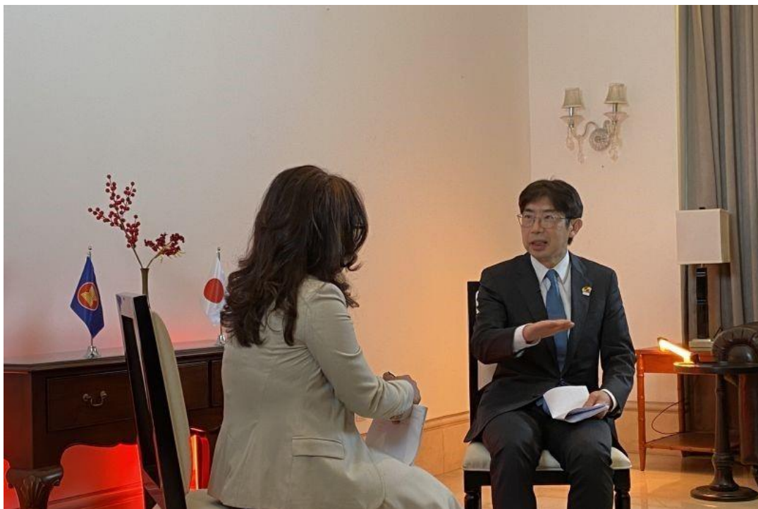
Interview by Antara News Agency (13 April 2023)

In June, JJS will visit the ASEAN Secretariat to view and they also present the Proposal and Statement of Determination in late July. I will passionately expand the understanding and action of the next generation through meeting the children who will build the future of Japan and ASEAN.