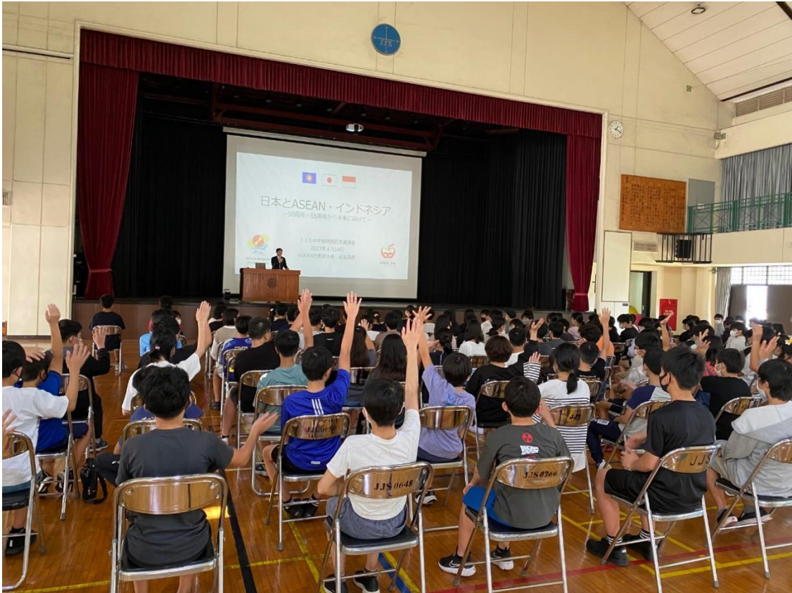
Lecture at the Jakarta Japanese School (14 April 2023)

How were your Eid holidays? I stayed in Jakarta for the holidays and had a relaxing weekend.