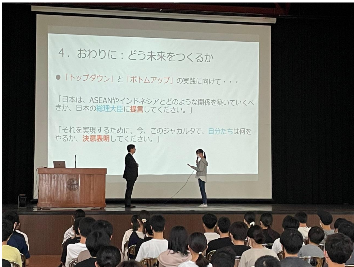
Lecture at the Japanese School of Jakarta (14 April 2023)

The possibilities of ASEAN-Japan cooperation are enormous. To name but a few, the use of digital technology to improve connectivity and to support start-ups within and beyond ASEAN. Taking the opportunity of 50th Year of ASEAN-Japan Friendship and Cooperation this year, I would like to listen closely to the needs from ASEAN member states, the ASEAN Secretariat and other stakeholders. We hope to realise high-impact initiatives that will lead to the co-creation of value between ASEAN and Japan.