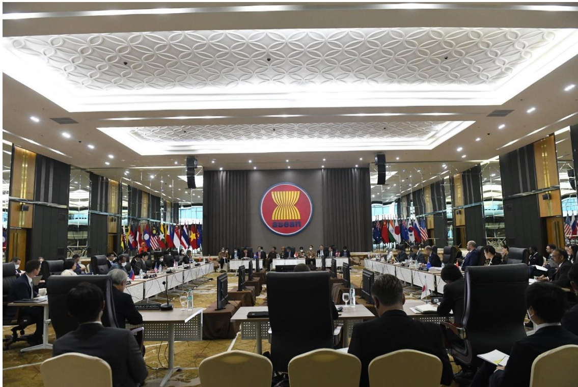
EAMJ (1 March 2023,).

would like to report to you on these meetings and events.