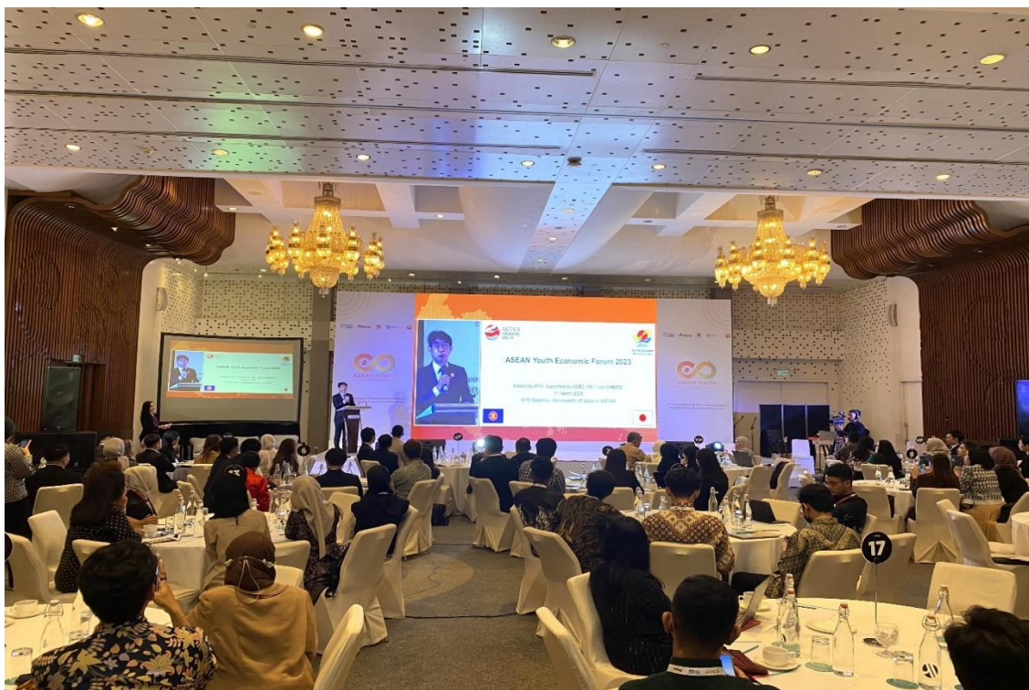
Welcome remarks at the ASEAN Youth Economic Forum (17 March 2023)