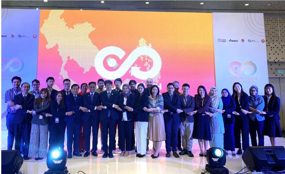
ASEAN Youth Economic Forum (17 March 2023)

In this first quarter of 2023, the kick-off of the 50th Year of ASEAN-Japan Friendship and Cooperation concluded and a series of ASEAN-related meetings are in full swing these coming months.