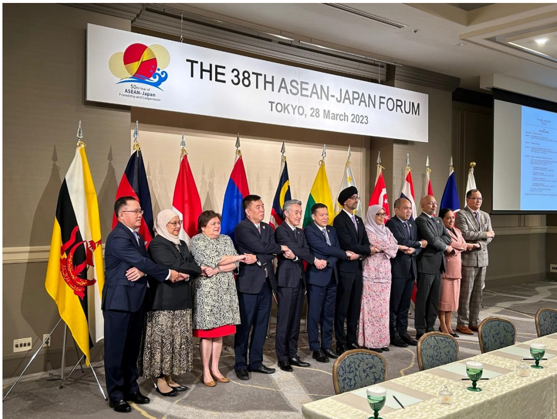
ASEAN-Japan Forum (28 March 2023)

ASEAN has taken the initiative to establish several institutes in their respective countries, bearing the Member State's particular strength, to benefit the whole ASEAN region. Japan has been cooperating and working directly with these centres mainly through the Japan-ASEAN Integration Fund (JAIF). In the future, I would like to further support the activities of the institutes, making full use of Japan's strengths and knowledge.