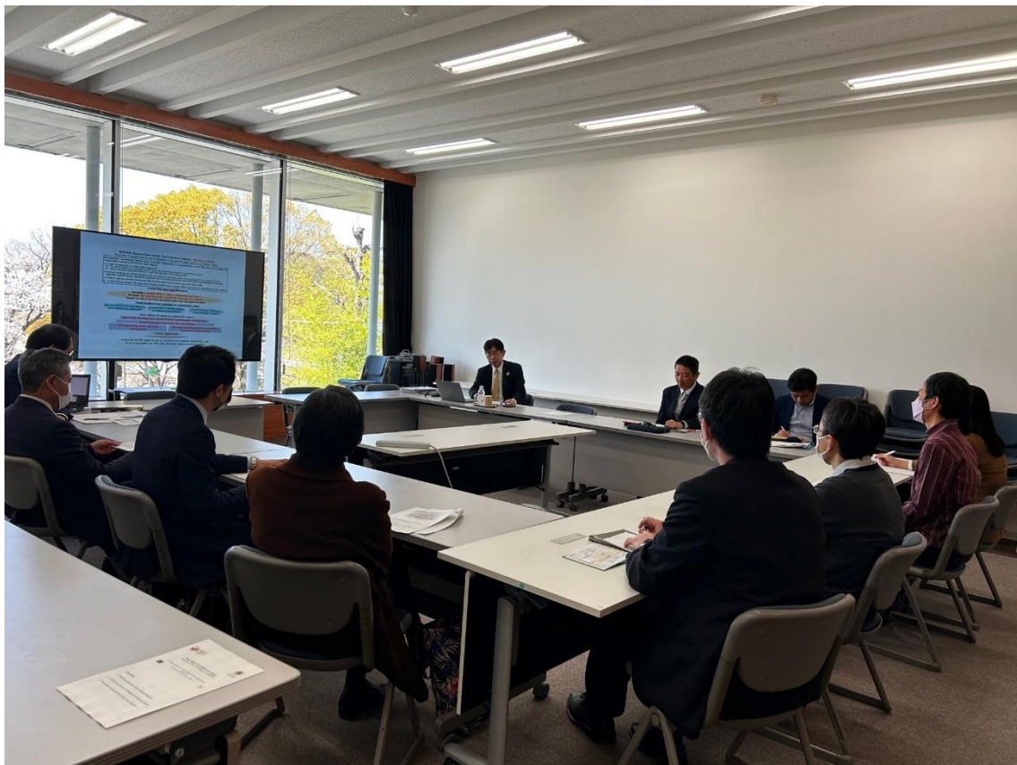
Discussion at the Institute for Southeast Asian Area Studies, Kyoto University, (29 March 2023)

The meeting discussed regional and international developments, as well as the direction of strengthening relations in the lead-up to the ASEAN-Japan Special Summit to be held in Tokyo around December. This is the first time in three years that the meeting was held face-to-face. The timing was perfect, allowing the ASEAN countries and the ASEAN Secretariat participants to enjoy the cherry blossoms in Japan.