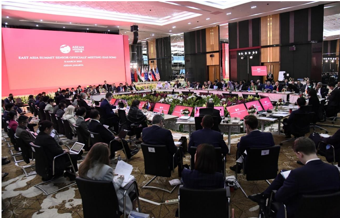
EAS/SOM meeting (8 March 2023,).