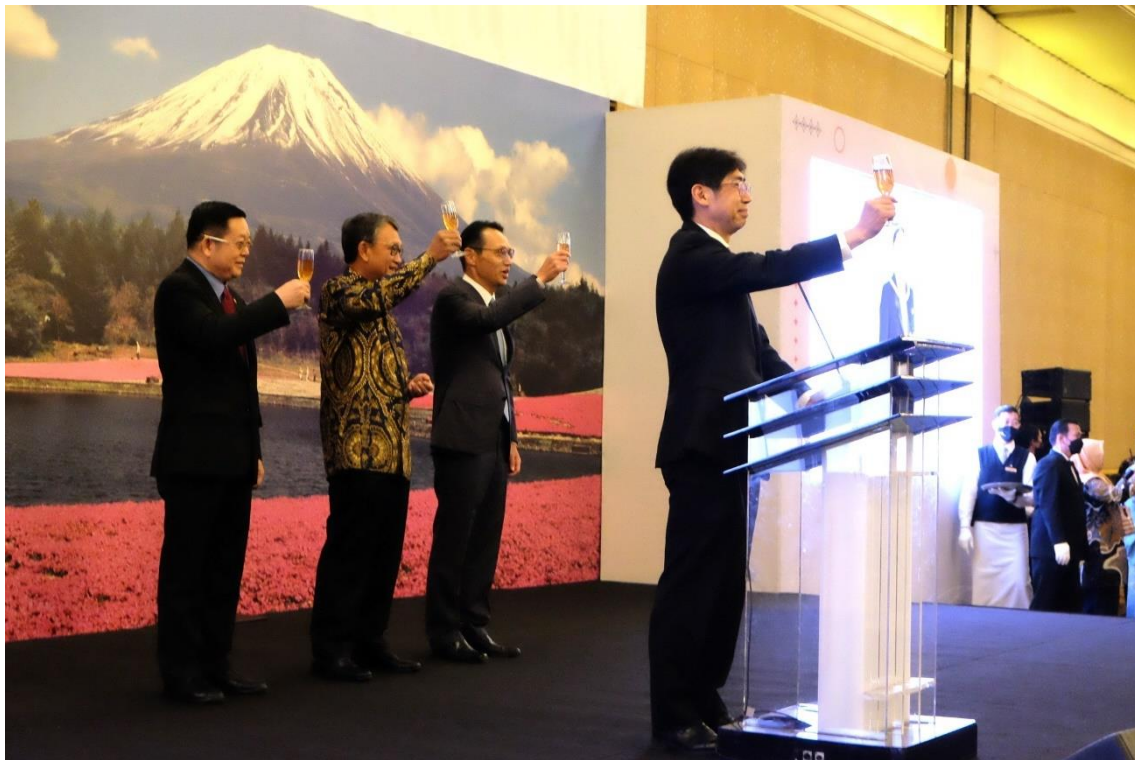
Toast at the Emperor's Birthday Celebration Reception (23 February 2023)