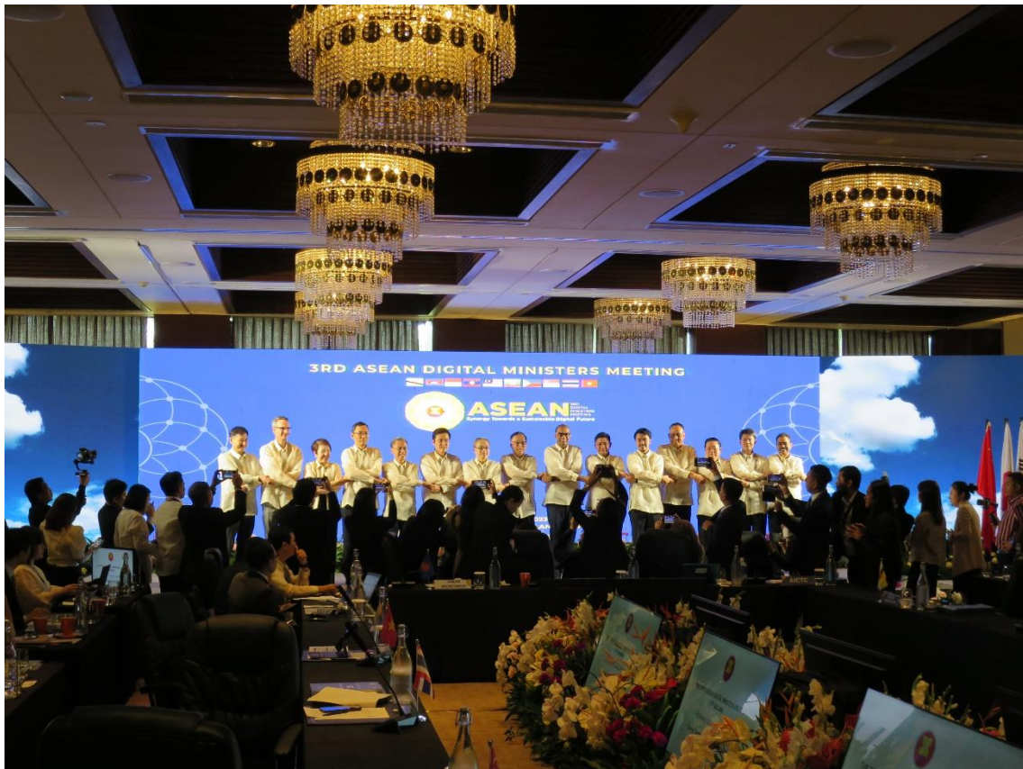
ASEAN-Japan Digital Minister's Meeting (10 February 2023, in Boracay, Philippines)