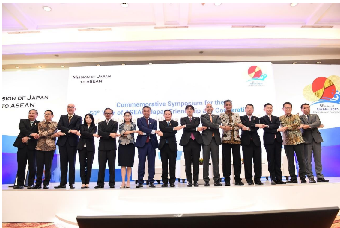
Commemorative Symposium of the 50th Year of ASEAN-Japan Friendship and Cooperation. (13 February 2023,)

The 50th Year of ASEAN-Japan Friendship and Cooperation was kicked off!! In February, two major events, the Commemorative Symposium and Japan’s National Day Reception, were held one after another. Ministerial level meetings between ASEAN and Japan also began, starting with the tourism and digital sectors.