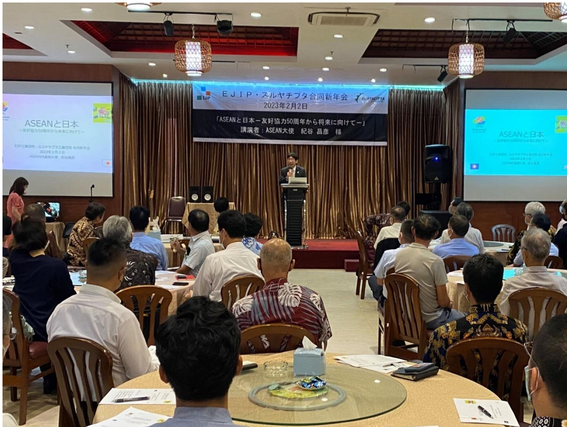
Speech at the Joint EJIP-Suryacipta Industrial Estate New Year's party (2 February 2023)