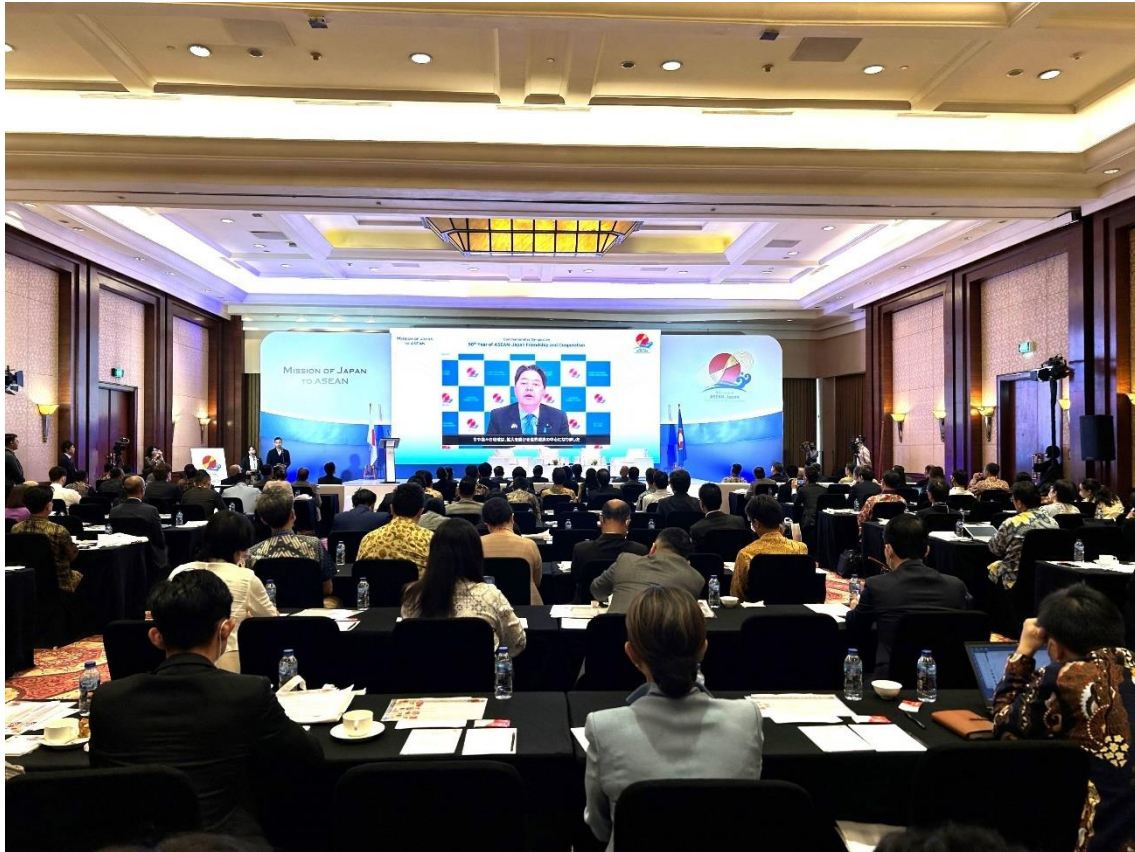
Video message from Foreign Minister Mr. HAYASHI at the Symposium (13 February 2023)

ASEAN-Japan Cyber Security Capacity Building Centre . In this meeting, it confirmed that the centre has achieved its goal of training more than 700 cybersecurity experts in 2018-2022, and welcomed the launch of the next phase in 2023-2027.