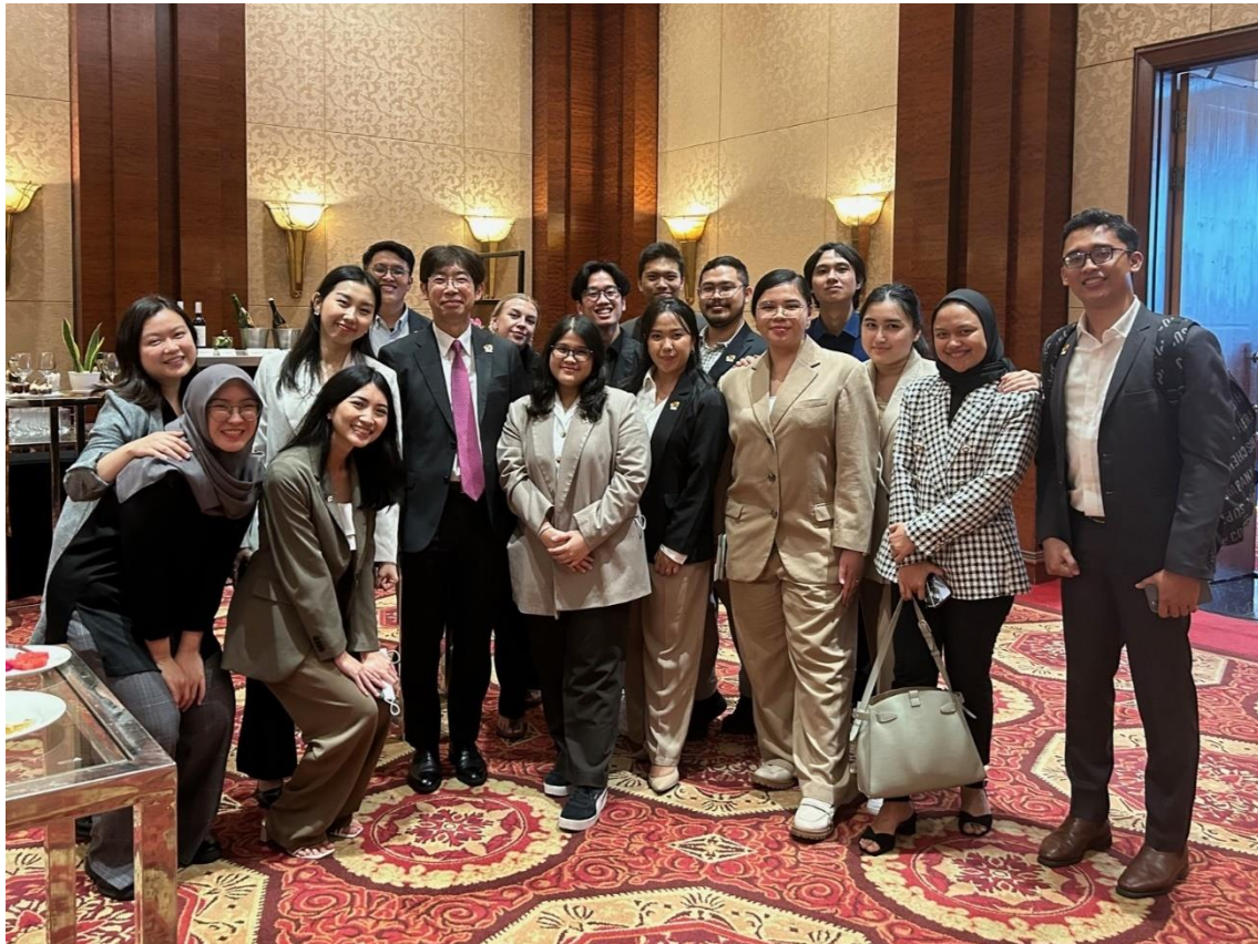
With FPCI young staff and interns at the Commemorative Symposium (13 February 2023)

In this meeting, the participants brainstormed concrete measures to promote cooperation between Japan and ASEAN in solving issues, and to promote the movement and circulation of people across borders in the region. Furthermore, the participants agreed on the importance of promoting cooperation between stakeholders towards the next generation of exchanges between ASEAN and Japan. We hope that the Japan-ASEAN Management Council will take the initiative to this end.