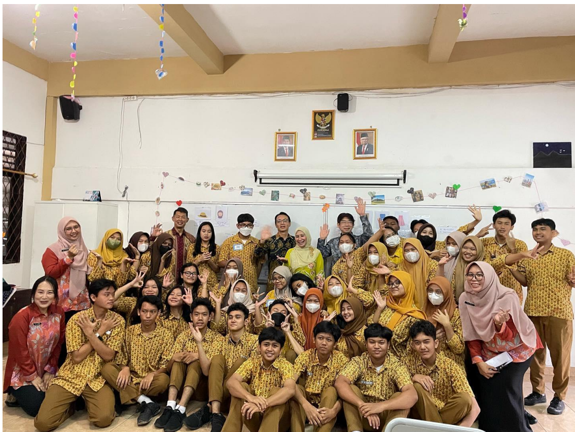
Japanese language class visit