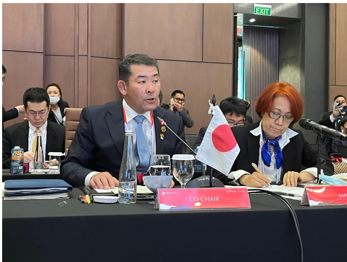
Mr. ISHII, State Minister of Land, Infrastructure, Transport and Tourism at the 22nd Meeting of ASEAN Tourism Ministers Plus Three (4 February 2023, in Yogyakarta).

In the first meeting, Mr. KIHARA, Deputy Chief Cabinet Secretary, instructed the relevant Ministries and Agencies to (1) proactively put forward cooperation projects and ideas, taking into account the priority areas of ASEAN; (2) work on strengthening public relations, cultural and personnel exchange to further promote grassroots exchanges among the civil society; and (3) to strengthen information sharing and cooperation among relevant Ministries and Agencies, and to work together as an “All-Japan” team.