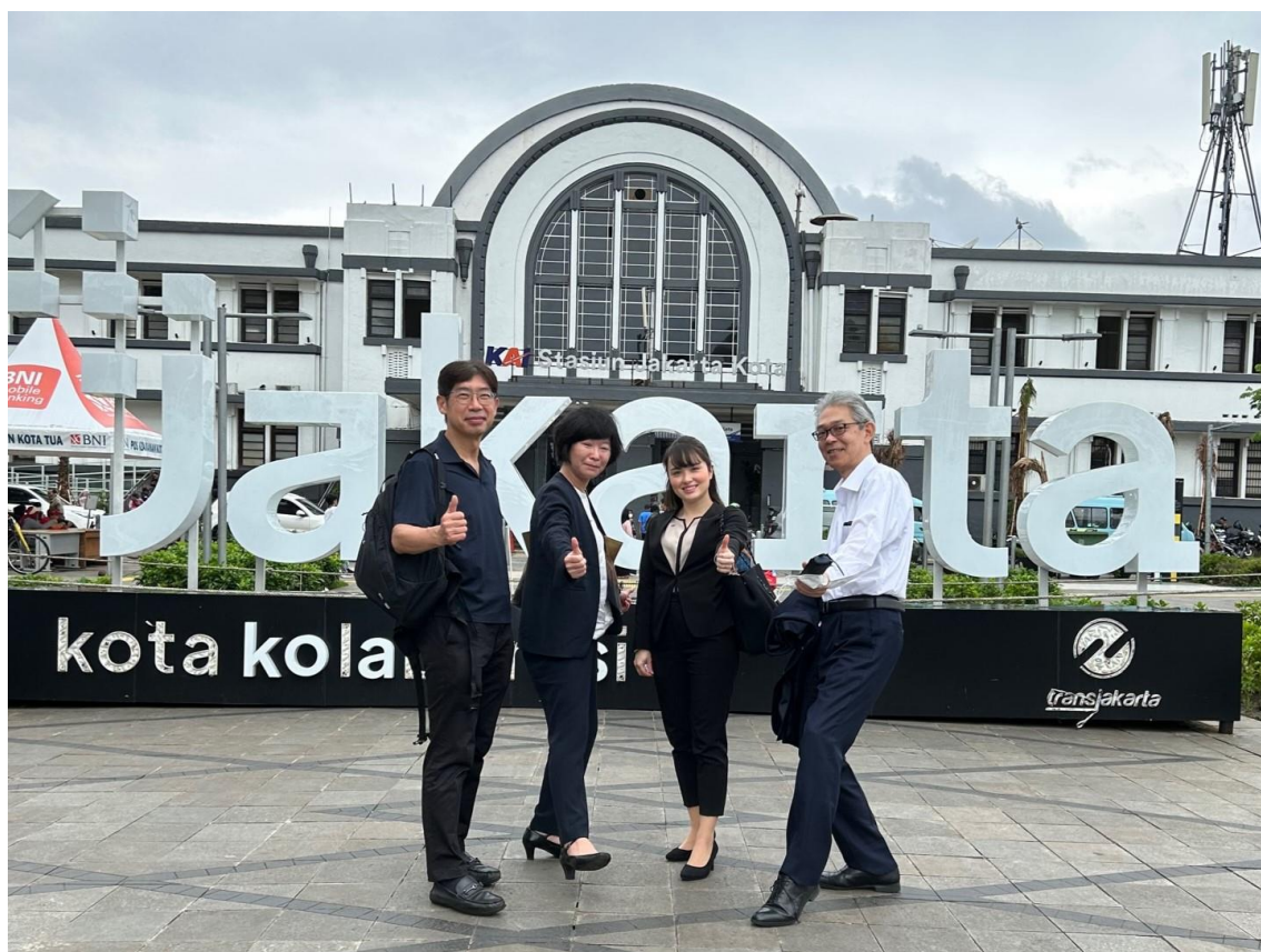
Discussions with officials of the Asia PT of the Japan Association of Corporate Executives (24-25 February 2023).