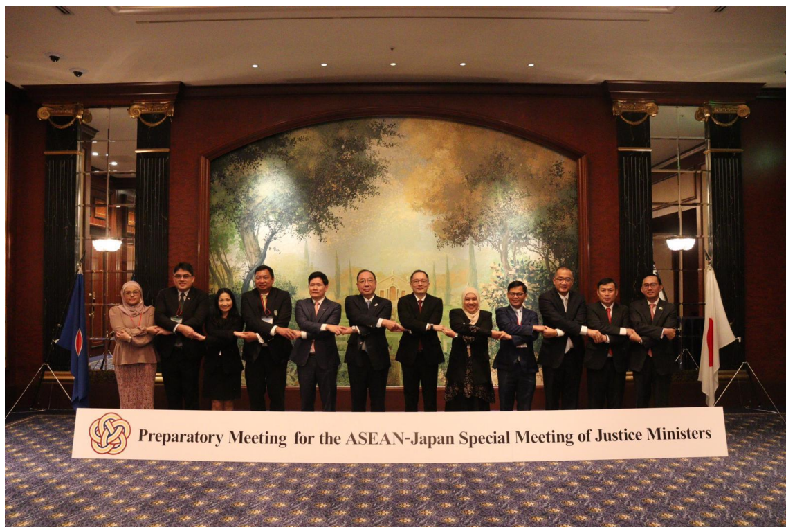
ASEAN-Japan Preparatory Meeting for the ASEAN-Japan Special Meeting of Justice Ministers (AJSMJ) (13 February 2023, provided by the ASEAN Secretariat).