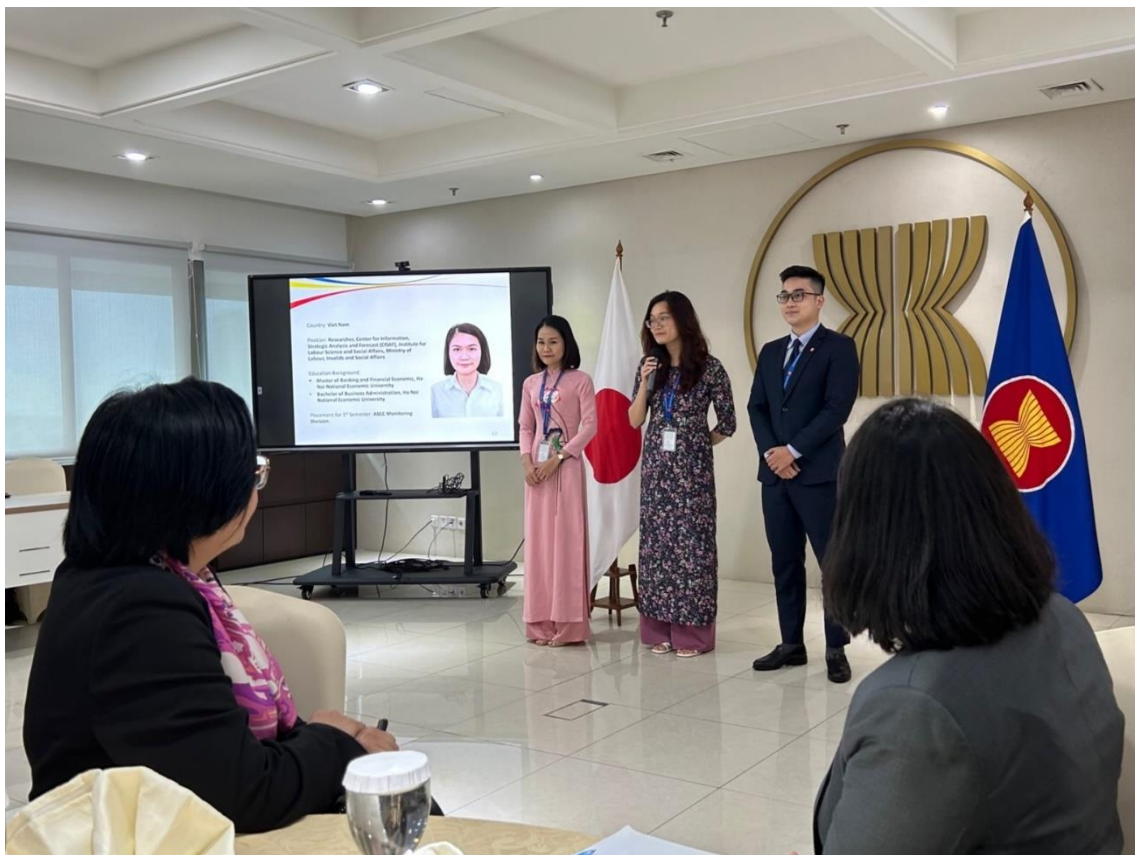
Opening Ceremony of the Attachment Programme to the ASEC for Officials from CLMV (2 February 2023)

Discussions have already begun on a new project presented by the Indonesian Chair of ASEAN-BAC to cooperate with Japan.