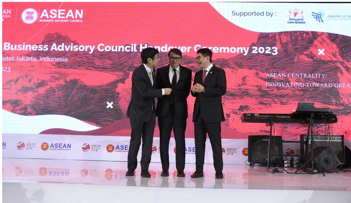
ASEAN Business Advisory Council Handover Ceremony (30 January 2023)

In this edition of the Ambassador's Newsletter, I would like to introduce the latest activities in both Japan and ASEAN for the 50th Year of ASEAN-Japan Friendship and Cooperation, which have been initiated in Jakarta and other parts of the region.