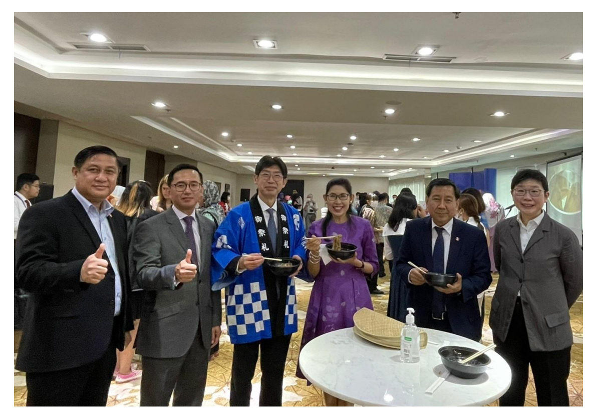
Experience Japanese Food Culture (Photo: 22 December 2022)