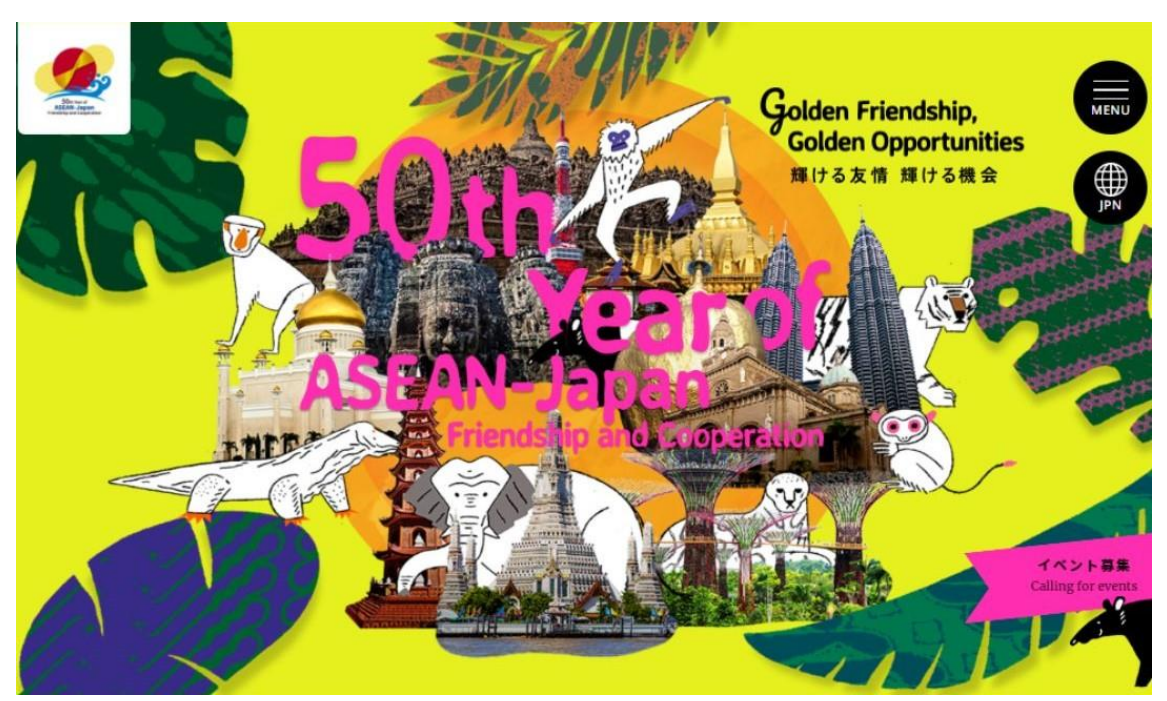
The 50<sup>th</sup> Year of ASEAN-Japan Friendship and Cooperation (Released on 21 December 2022)

In this dialogue, besides panels from companies and universities, young people from the generation Z also joined the discussion, while it was not planned, and that inter-generational discussion towards mainstreaming AOIP was immensely meaningful. If you are interested in it, please watch <u>the archived video</u>.