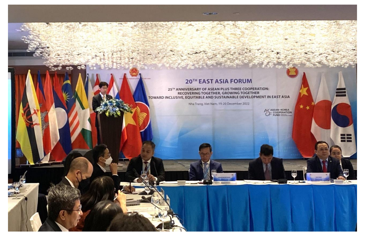
Opening remarks at the 20<sup>th</sup> East Asia Forum (Photo: 19 December 2022)