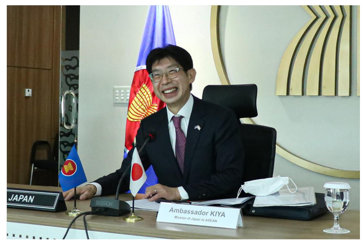
Press conference at ASEAN Secretariat (Photo: Jakarta Shimbun, 1 December 2022)