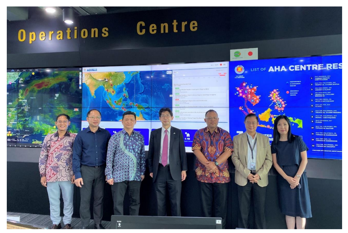
Visit to the ASEAN Coordination Centre for Humanitarian Assistance on Disaster Management (AHA Centre) (Photo: 15 December 2022)

At the beginning of the meeting, I first stated that I had adjusted my arrival in time for this important meeting. I also expressed that Japan would like to actively support the "Digital Innovation and Sustainable Economic Centre" to be established by ERIA. Furthermore, I conveyed my determination to collaborate with ERIA, ASEC, AMS and other Dialog partners towards the 50<sup>th</sup> Year of ASEAN-Japan Friendship and Cooperation.