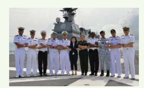
Japan-ASEAN Ship-Rider Cooperation Program on JMSDF Ship JS IZUMO

• Vientiane Vision : Japan's Defense Cooperation Initiative with ASEAN in 2016 for ASEAN-wide defense cooperation.